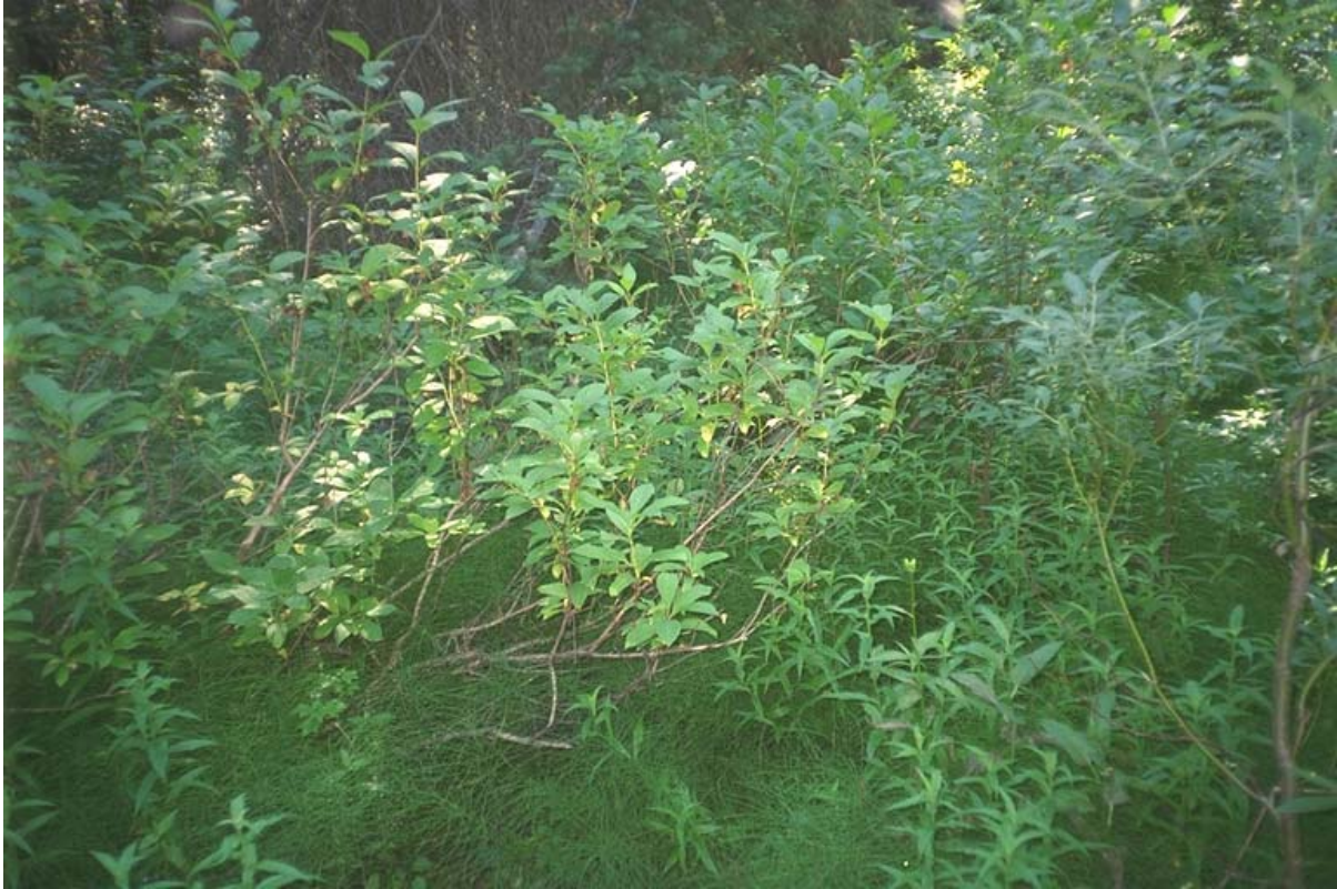
Direction of Photo: D CD #: 2 Image #: 10 Roll #: P1 Frame #: 10 Comment: View of non classified drainage in forest 320 metres upstream of the confluence with Peter Aleck Creek.

Site # 12 ILP # 70033 ILP Map # 093L.006 Reach # 1.0 Watershed Code: 000-000000-00000-00000-0000-000-000-000-000-000-000-000