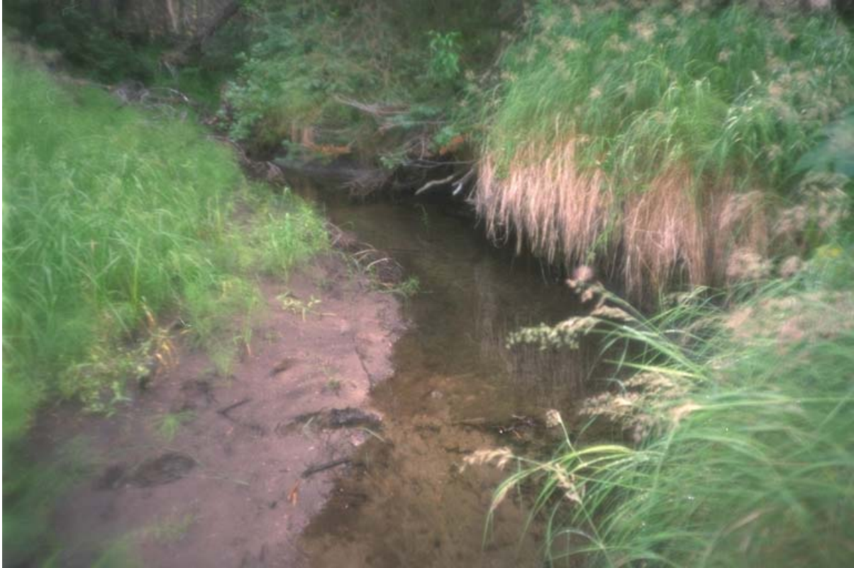
Direction of Photo: U CD #: 2 Image #: 45 Roll #: P3 Frame #: 12 Comment: View of site 125 metres upstream of confluence with Peter Aleck Creek.

Site # 20 ILP # 70051 ILP Map # 093L.006 Reach # 1.0 Watershed Code: 000-000000-00000-00000-0000-000-000-000-000-000-000-000