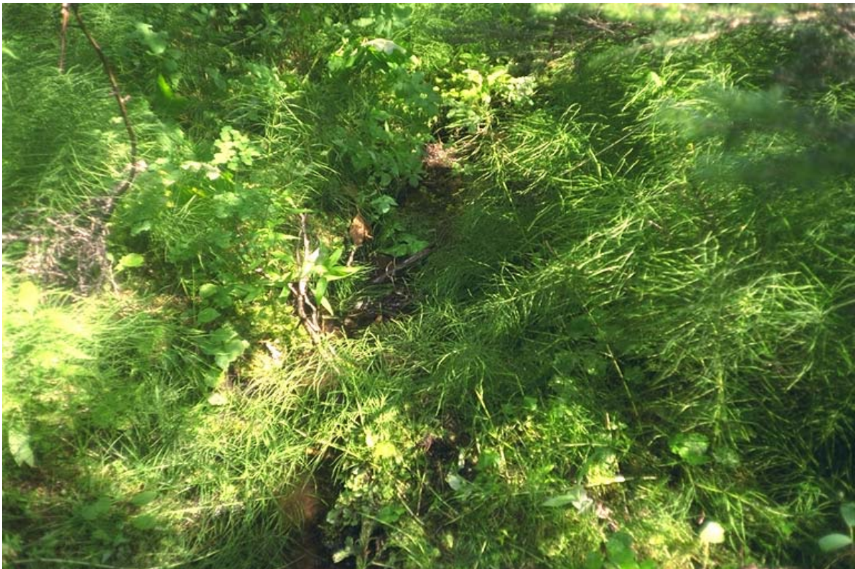
Direction of Photo: D CD #: 2 Image #: 4 Roll #: P1 Frame #: 4 Comment: 150 metres upstream of the confluence with Peter Aleck Creek.