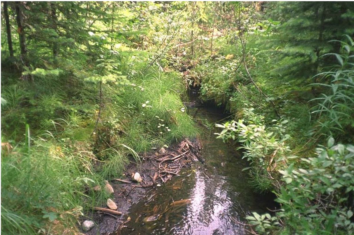
Direction of Photo: D CD #: 2 Image #: 63 Roll #: P4 Frame #: 8 Comment: Approximately 100 metres upstream of the wetland mainstem ILP 70051.