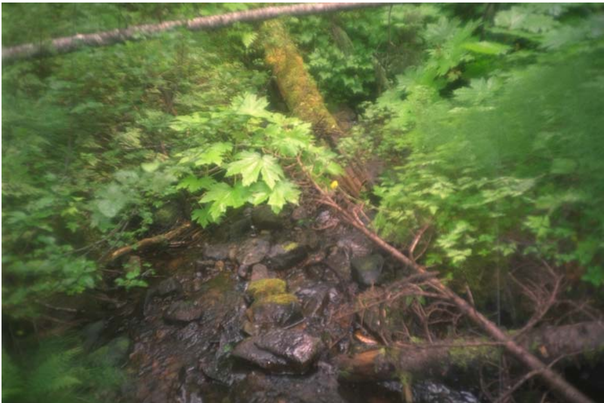
Direction of Photo: D CD #: 2 Image #: 39 Roll #: P3 Frame #: 6 Comment: View of site approximately 40 metres upstream of the mapped confluence with Peter Aleck Creek.