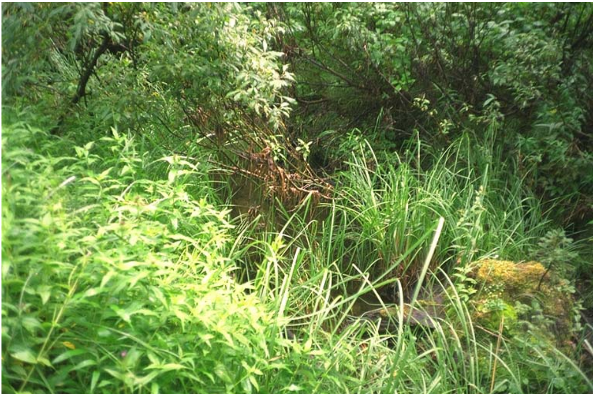
Direction of Photo: D CD #: 2 Image #: 57 Roll #: P4 Frame #: 2 Comment: Approximately 50 metres downstream of the confluence with tributary ILP 70060.