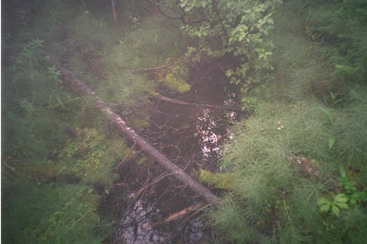
Direction of Photo: U CD #: 2 Image #: 36 Roll #: P3 Frame #: 3 Comment: View of site approximately 90 metres upstream of the confluence with Peter Aleck Creek.

Site # 28 ILP # 70063 ILP Map # 093L.006 Reach # 1.0 Watershed Code: 000-000000-00000-00000-0000-000-000-000-000-000-000-000