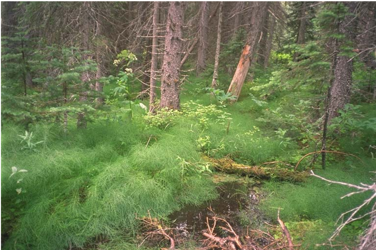
Direction of Photo: U CD #: 2 Image #: 60 Roll #: P4 Frame #: 5 Comment: Approximately 100 metres upstream of Peter Aleck Creek.