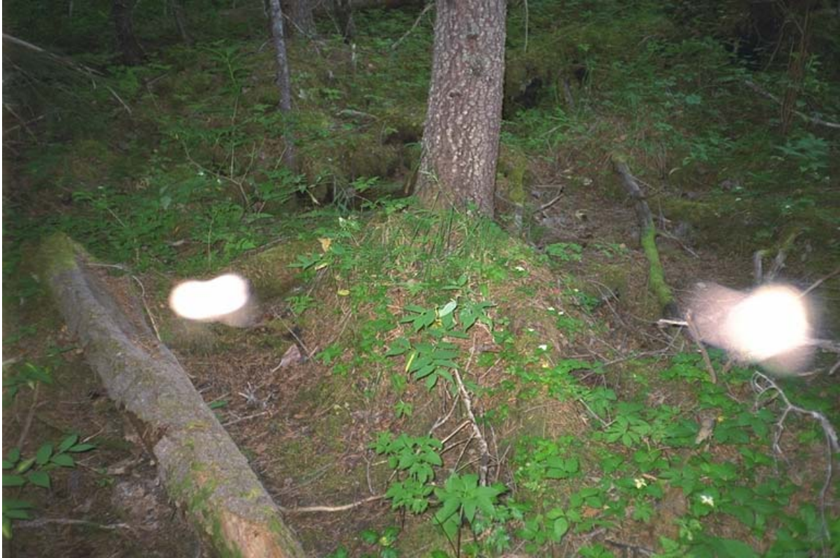
Direction of Photo: U CD #: 2 Image #: 28 Roll #: P2 Frame #: 8 Comment: View of site 190 metres upstream from wetland in reach 1.

Site # 5 ILP # 70018 ILP Map # 093L.006 Reach # 2.0 Watershed Code: 000-000000-00000-00000-0000-0000-000-000-000-000-000-000