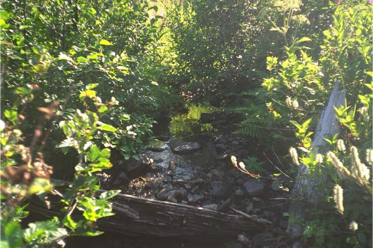
Direction of Photo: U CD #: 2 Image #: 29 Roll #: P2 Frame #: 1 Comment: View 35 metres upstream from reach 1 / 2 break.

Site # 6 ILP # 70021 ILP Map # 093L.006 Reach # 2.0 Watershed Code: 000-000000-00000-00000-0000-0000-000-000-000-000-000-000