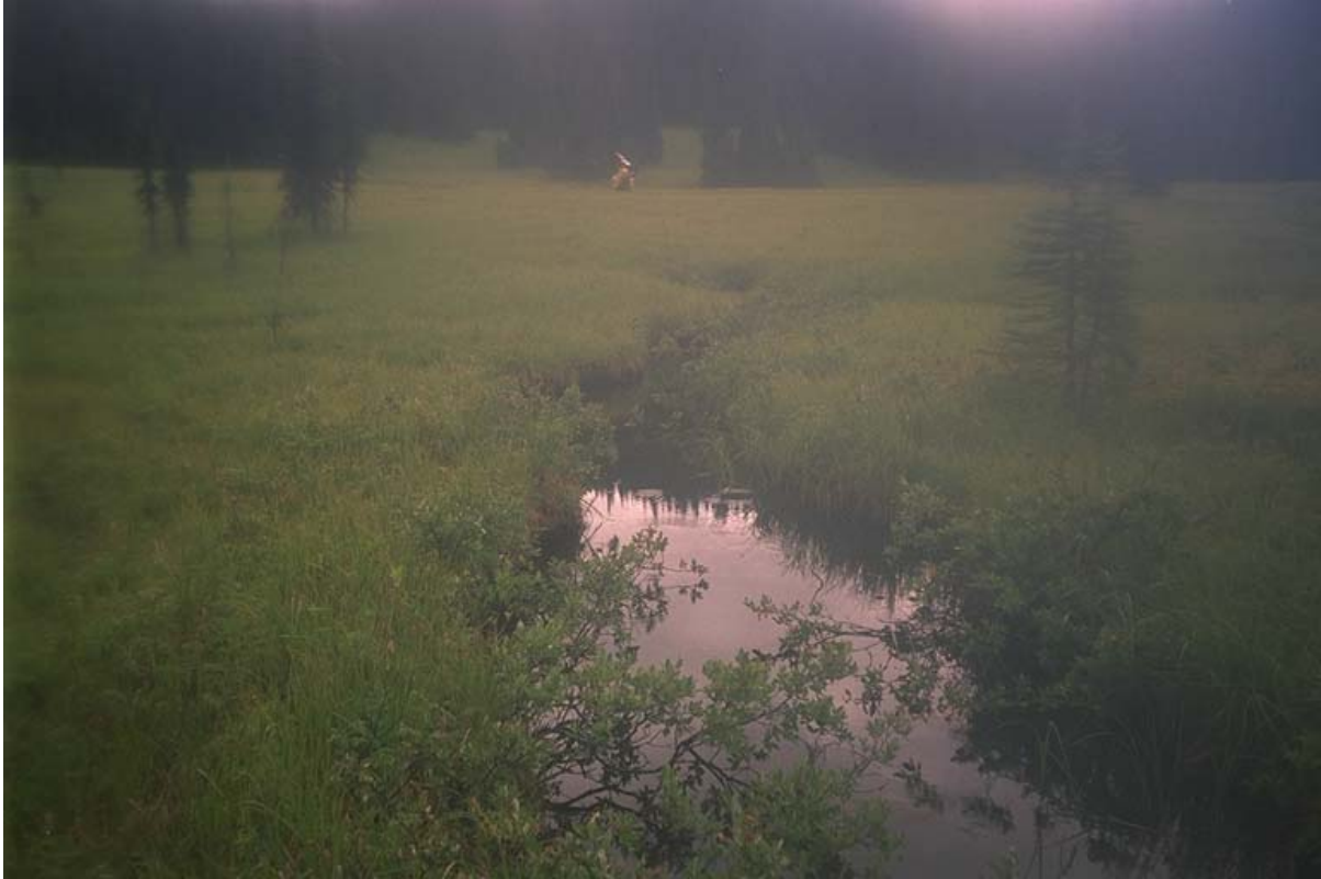
Direction of Photo: U CD #: 2 Image #: 51 Roll #: P3 Frame #: 18 Comment: View of site 100 metres upstream from reach 2 (edge of wetland).

Site # 7 ILP # 70021 ILP Map # 093L.006 Reach # 3.0 Watershed Code: 000-000000-00000-00000-0000-0000-000-000-000-000-000-000