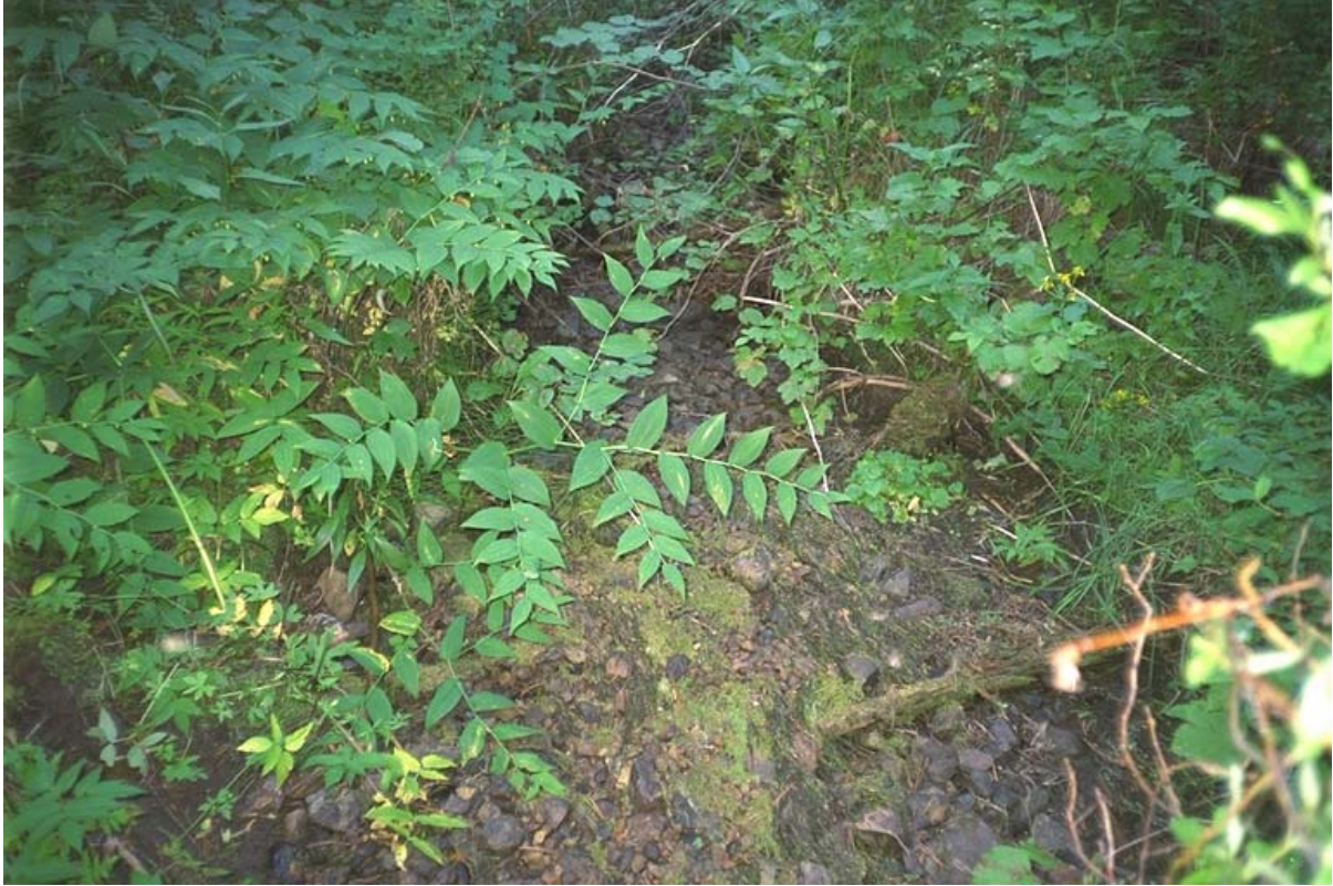
Direction of Photo: U CD #: 2 Image #: 25 Roll #: P2 Frame #: 5 Comment: View of site 100 meters downstream of pond at the start of reach 5.

Site # 3 ILP # 70013 ILP Map # 093L.006 Reach # 4.0 Watershed Code: 000-000000-00000-00000-0000-0000-000-000-000-000-000-000