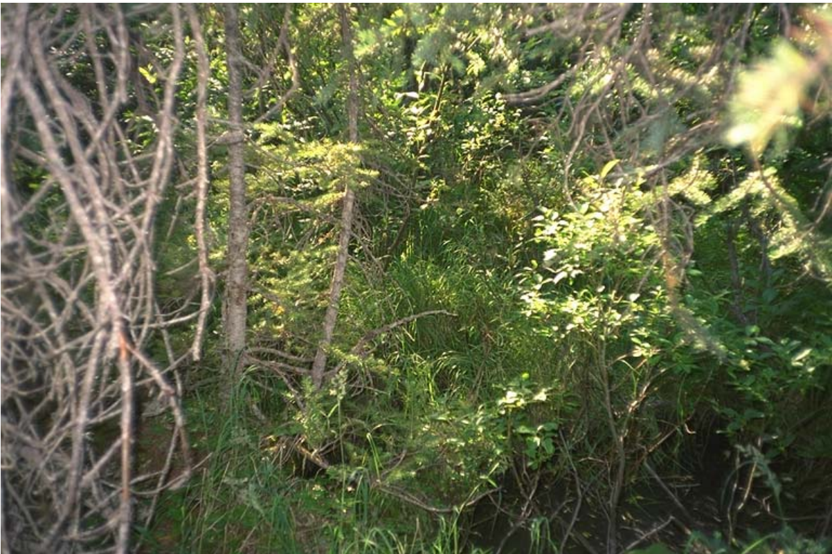
Direction of Photo: D CD #: 2 Image #: 32 Roll #: P2 Frame #: 4 Comment: View of site 100 metres upstream of wetland in reach 5.