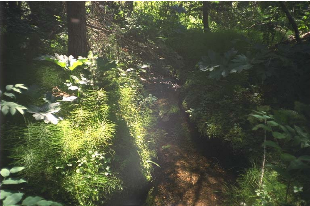
Direction of Photo: D CD #: 2 Image #: 19 Roll #: P1 Frame #: 19 Comment: View of site 225 metres upstream of the confluence with Peter Aleck Creek.