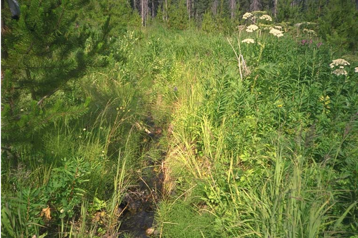
Direction of Photo: U CD #: 2 Image #: 1 Roll #: P1 Frame #: 1 Comment: View 60 metres upstream of Peter Aleck Creek, showing gravels.

Site # 15 ILP # 70041 ILP Map # 093L.006 Reach # 1.0 Watershed Code: 000-000000-00000-00000-0000-000-000-000-000-000-000-000