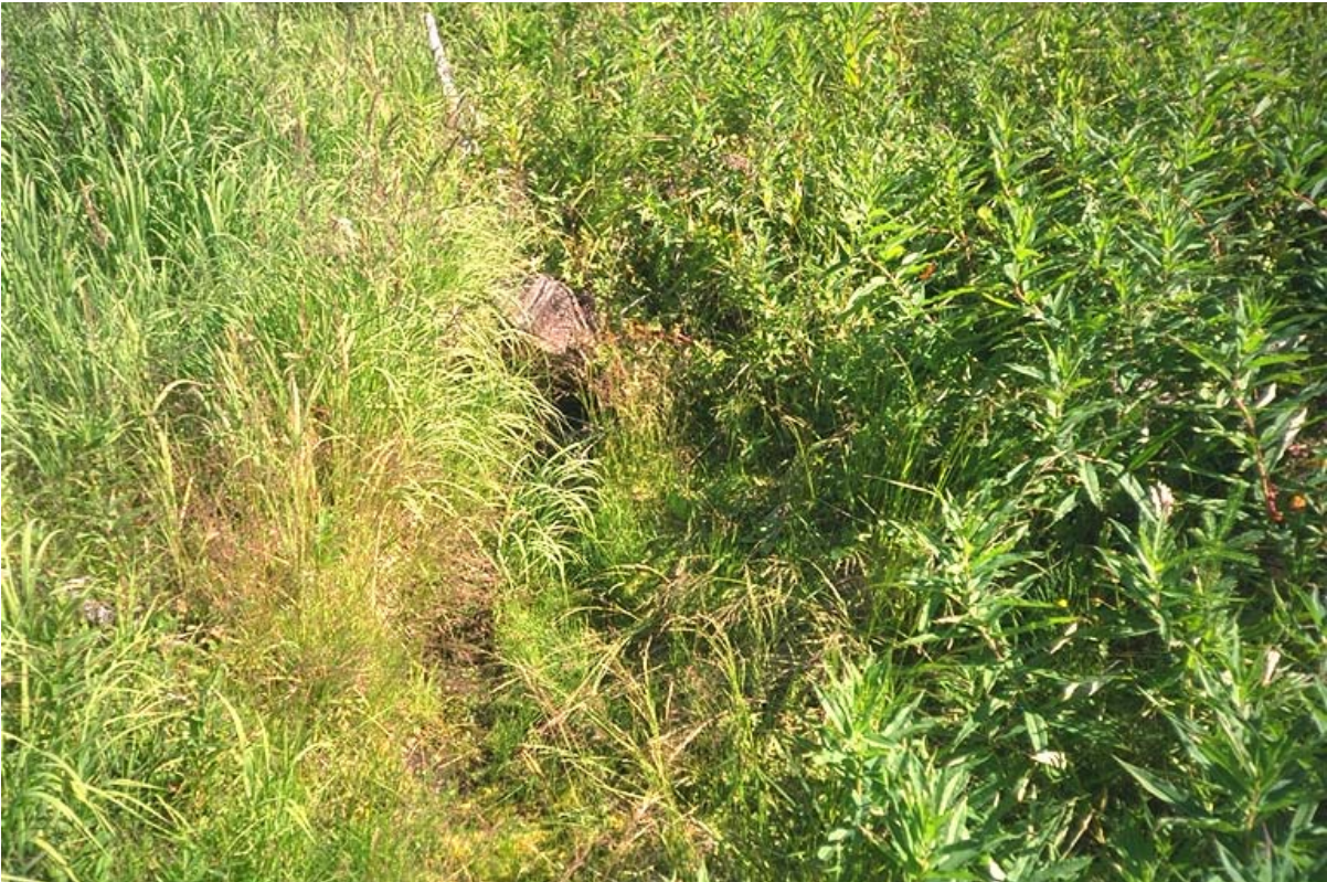
Direction of Photo: D CD #: 2 Image #: 21 Roll #: P1 Frame #: 21 Comment: View 275 metres upstream of the confluence with ILP 70034.