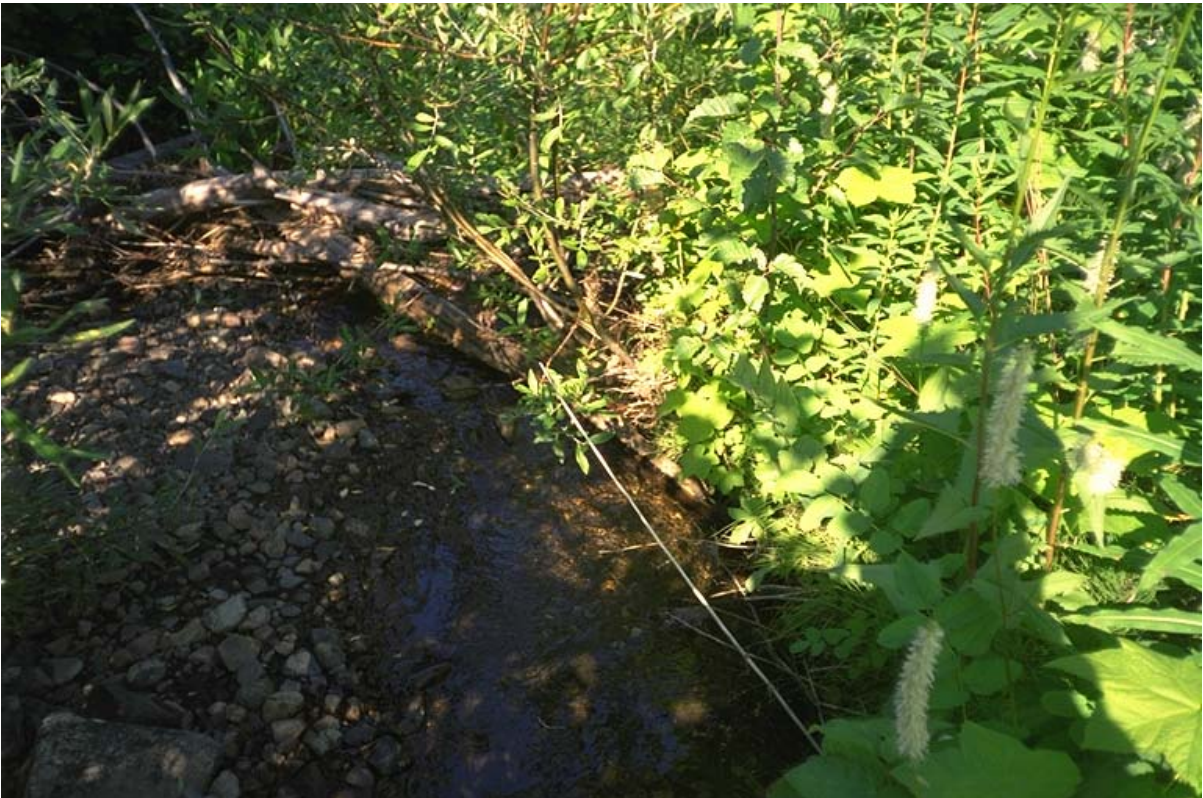
Direction of Photo: D CD #: 2 Image #: 30 Roll #: P2 Frame #: 2 Comment: View 35 metres upstream from reach 1 / 2 break.