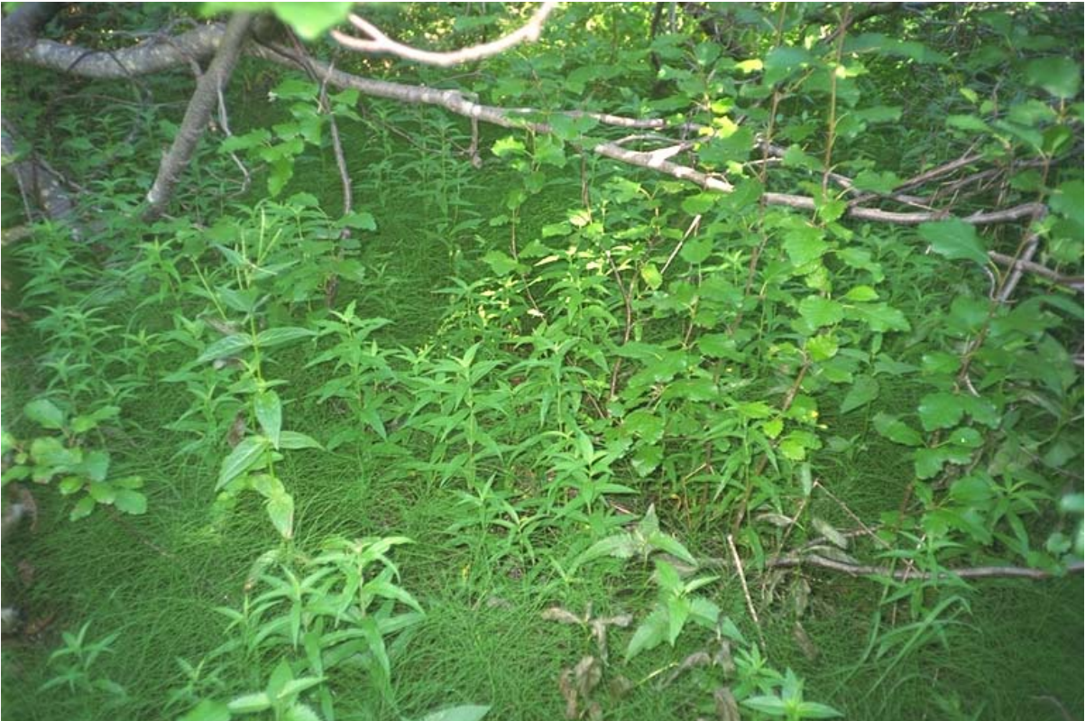
Direction of Photo: U CD #: 2 Image #: 9 Roll #: P1 Frame #: 9 Comment: View of non classified drainage in forest 320 metres upstream of the confluence with Peter Aleck Creek.