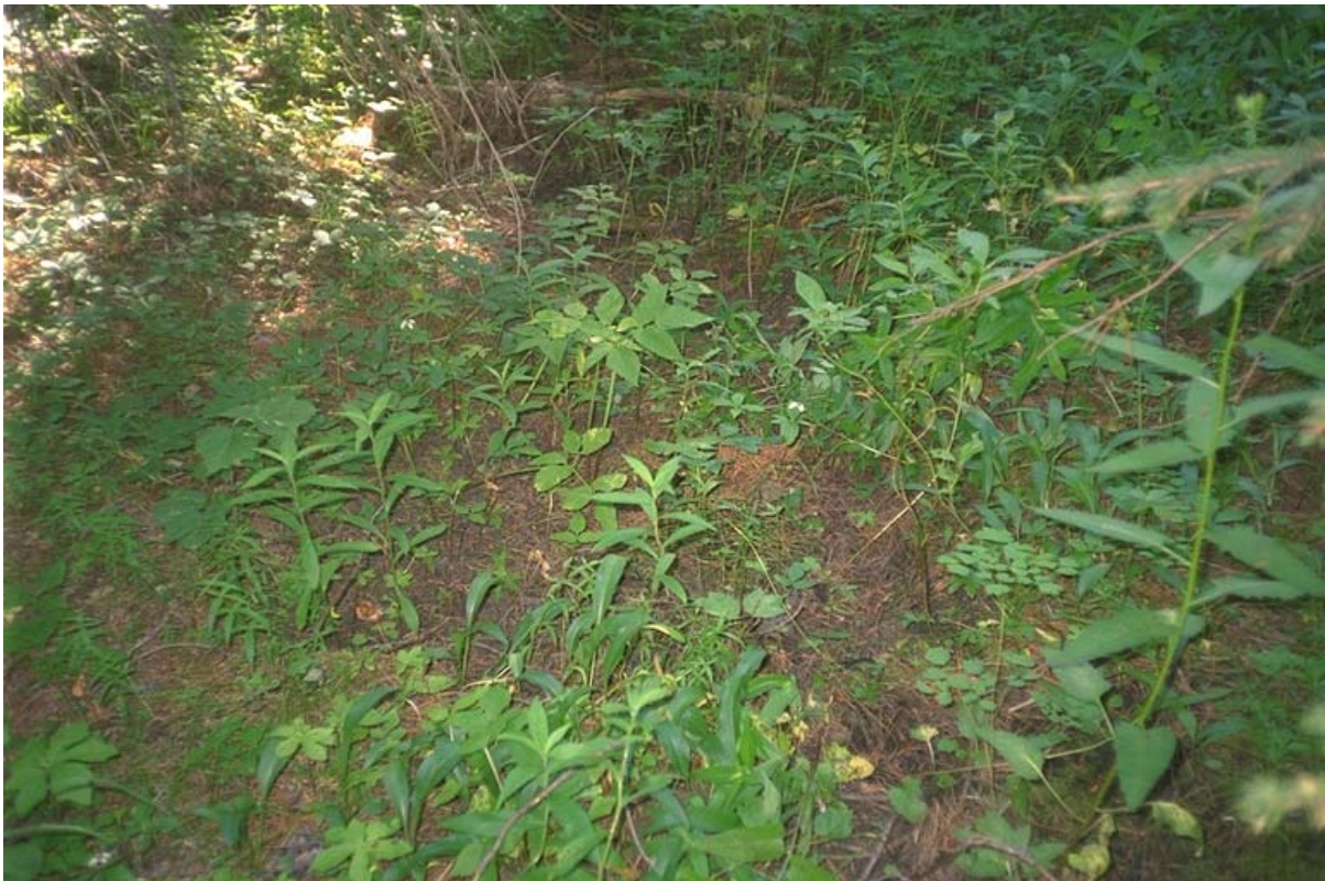
Direction of Photo: D CD #: 2 Image #: 11 Roll #: P1 Frame #: 11 Comment: View of "channel" in non classified drainage section 300 metres upstream of Peter Aleck Creek.