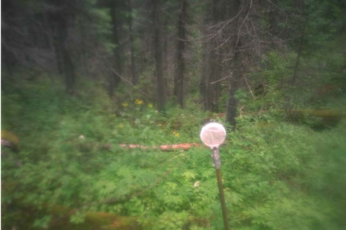
Direction of Photo: U CD #: 2 Image #: 49 Roll #: P3 Frame #: 16 Comment: View of site approximately 200 metres upstream of the confluence with tributary ILP 70062.

Site # 27 ILP # 70061 ILP Map # 093L.006 Reach # 2.0 Watershed Code: 000-000000-00000-00000-0000-0000-000-000-000-000-000-000