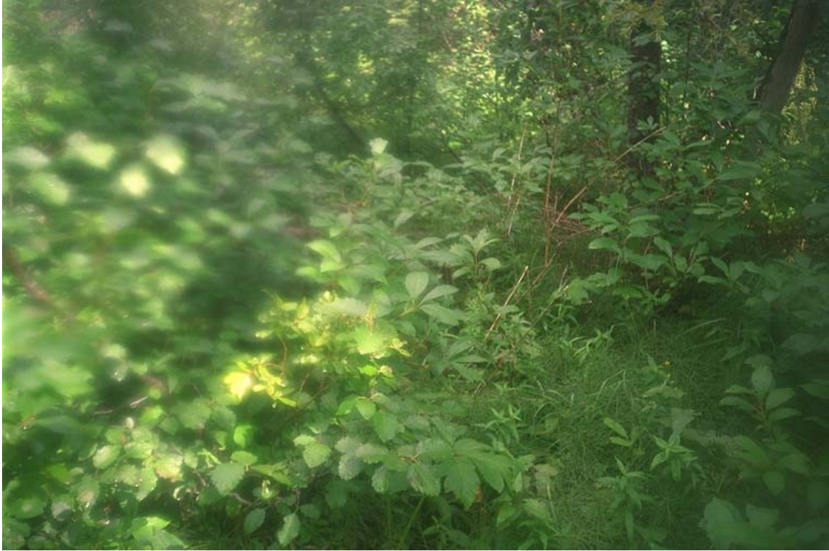
Direction of Photo: U CD #: 2 Image #: 47 Roll #: P3 Frame #: 14 Comment: View of site approximately 100 metres upstream of wetland in reach 1.

Site # 19 ILP # 70048 ILP Map # 093L.006 Reach # 2.0 Watershed Code: 000-000000-00000-00000-0000-0000-000-000-000-000-000-000