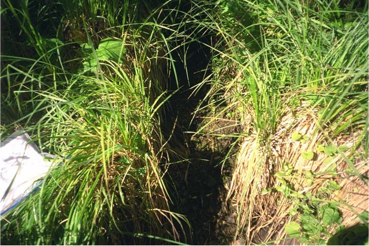
Direction of Photo: U CD #: 2 Image #: 12 Roll #: P1 Frame #: 12 Comment: View of large channel morphology 50 metres upstream of Peter Aleck Creek.

Site # 12 ILP # 70033 ILP Map # 093L.006 Reach # 1.0 Watershed Code: 000-000000-00000-00000-0000-0000-000-000-000-000-000-000