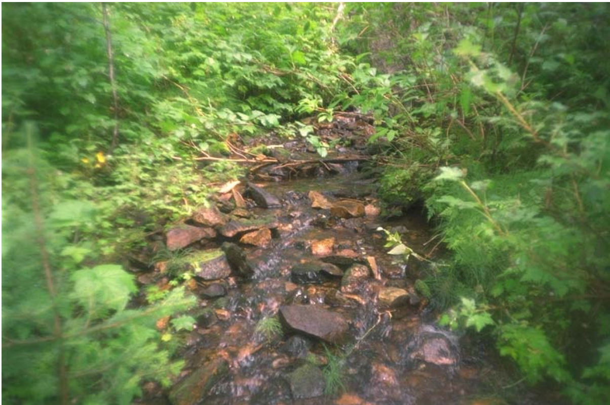
Direction of Photo: U CD #: 2 Image #: 43 Roll #: P3 Frame #: 10 Comment: View of site approximately 80 metres below the confluence with tributary ILP 70056.