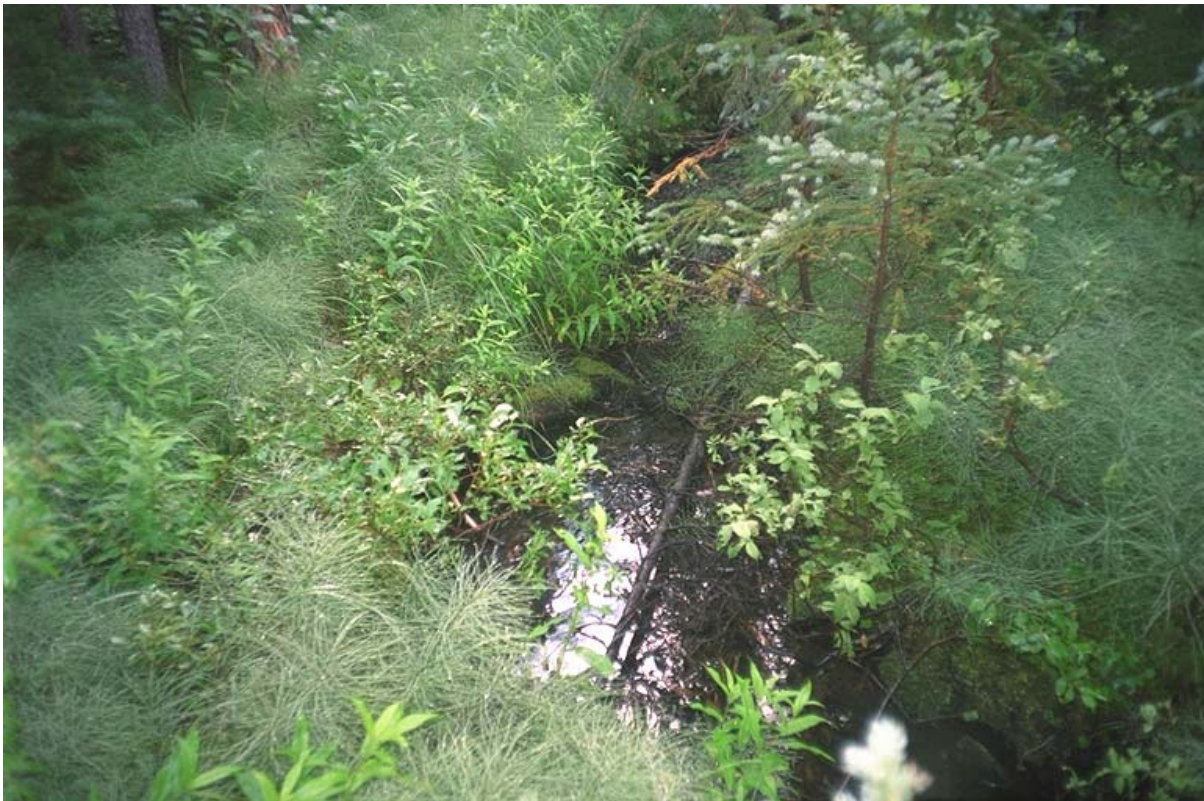
Direction of Photo: D CD #: 2 Image #: 37 Roll #: P3 Frame #: 4 Comment: View of site approximately 90 metres upstream of the confluence with Peter Aleck Creek.