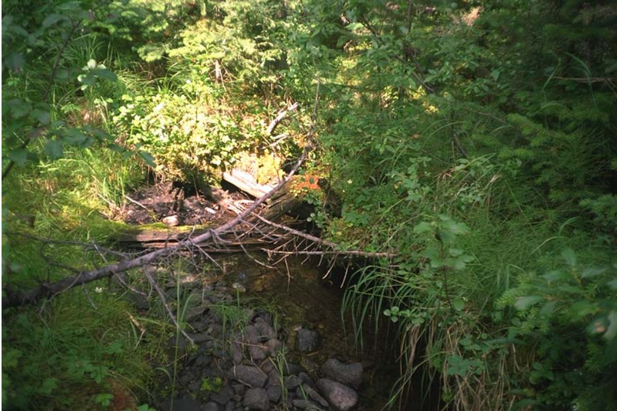
Direction of Photo: U CD #: 2 Image #: 62 Roll #: P4 Frame #: 7 Comment: Approximately 100 metres upstream of the wetland mainstem ILP 70051.

Site # 23 ILP # 70059 ILP Map # 093L.006 Reach # 1.0 Watershed Code: 000-000000-00000-00000-0000-000-000-000-000-000-000