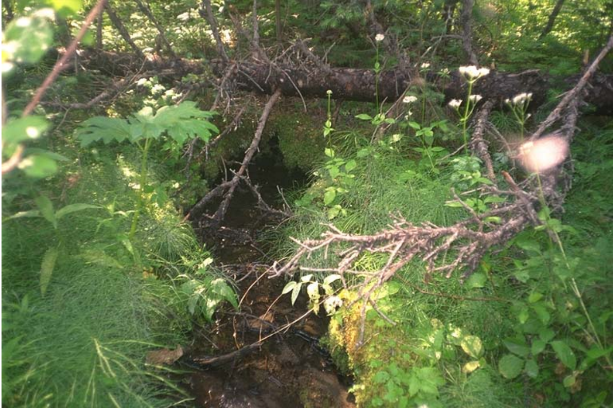
Direction of Photo: U CD #: 2 Image #: 3 Roll #: P1 Frame #: 3 Comment: 150 metres upstream of the confluence with Peter Aleck Creek.

Site # 16 ILP # 70043 ILP Map # 093L.006 Reach # 1.0 Watershed Code: 000-000000-00000-00000-0000-000-000-000-000-000-000