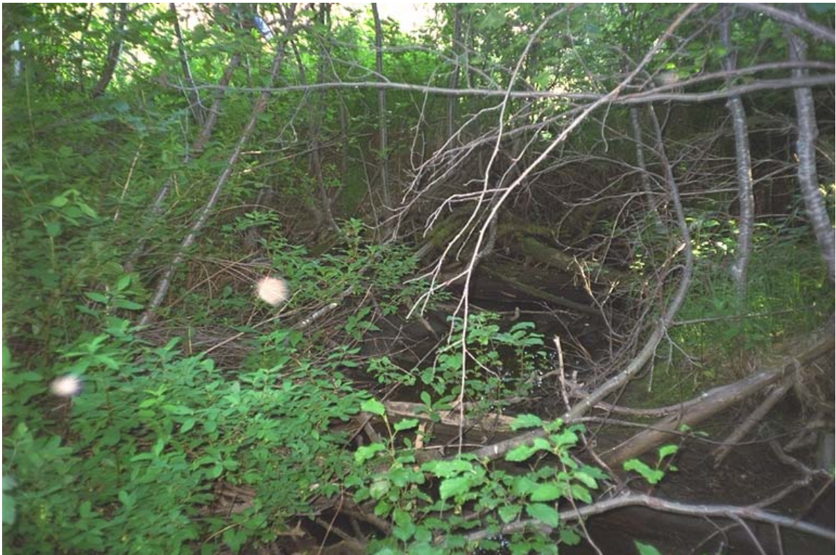
Direction of Photo: U CD #: 2 Image #: 27 Roll #: P2 Frame #: 7 Comment: View of residual pool and beaver dam immediately downstream of the pond in reach 5.