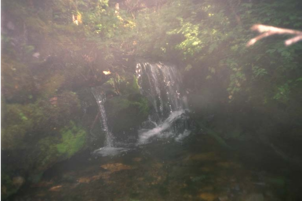
Direction of Photo: U CD #: 2 Image #: 40 Roll #: P3 Frame #: 7 Comment: View of falls approximately 250 metres upstream of the confluence with ILP 70056.

Site # 21 ILP # 70051 ILP Map # 093L.006 Reach # 2.0 Watershed Code: 000-000000-00000-00000-0000-0000-000-000-000-000-000-000