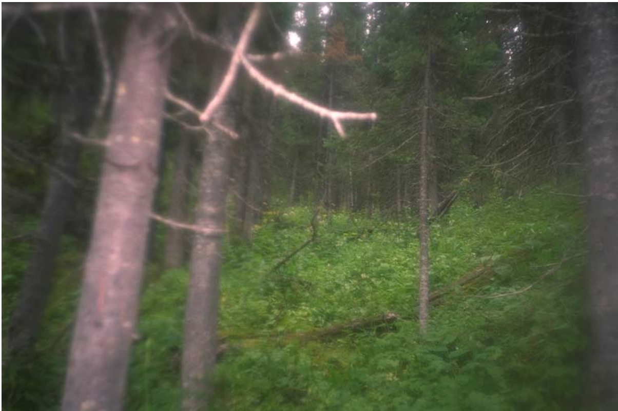
Direction of Photo: D CD #: 2 Image #: 50 Roll #: P3 Frame #: 17 Comment: View of site approximately 200 metres upstream of the confluence with tributary ILP 70062.