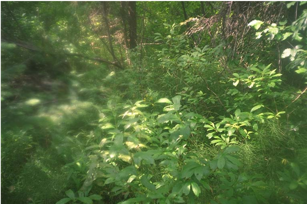
Direction of Photo: D CD #: 2 Image #: 48 Roll #: P3 Frame #: 15 Comment: View of site approximately 100 metres upstream of wetland in reach 1.