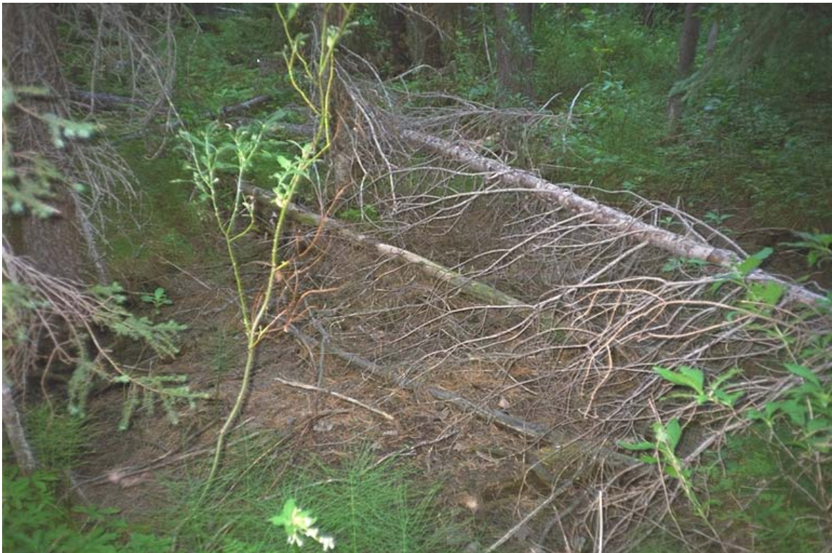
Direction of Photo: D CD #: 2 Image #: 33 Roll #: P2 Frame #: 9 Comment: View of site 190 metres upstream from wetland in reach 1.