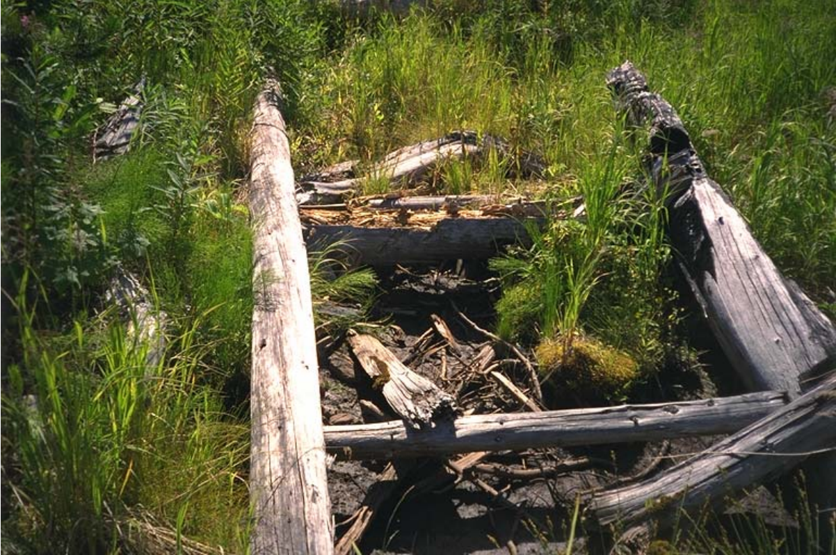
Direction of Photo: U CD #: 2 Image #: 20 Roll #: P1 Frame #: 20 Comment: View 275 metres upstream of the confluence with ILP 70034.

Site # 13 ILP # 70035 ILP Map # 093L.006 Reach # 1.0 Watershed Code: 000-000000-00000-00000-0000-000-000-000-000-000-000-000