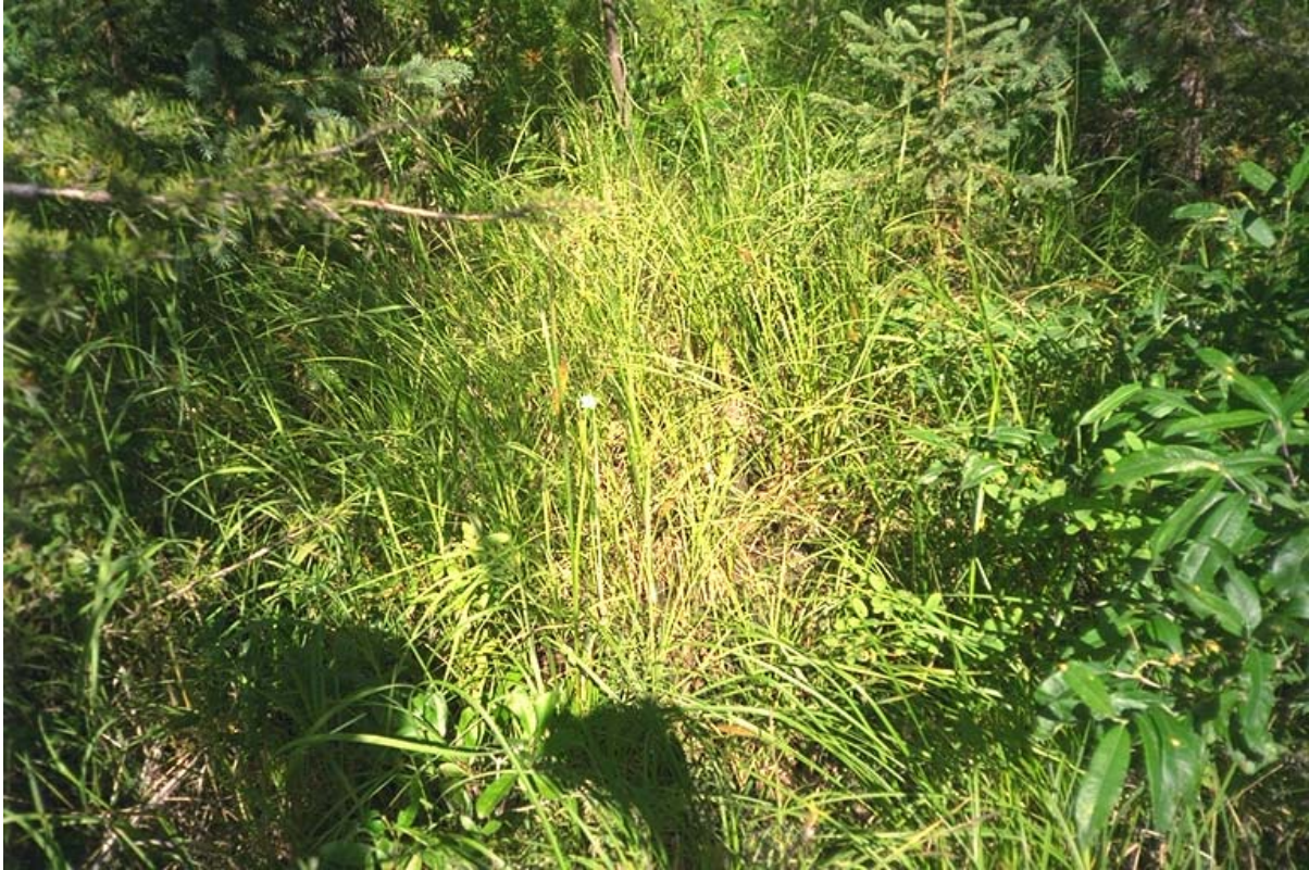
Direction of Photo: U CD #: 2 Image #: 16 Roll #: P1 Frame #: 16 Comment: View of site 100 metres upstream of the confluence with ILP 70034.

Site # 11 ILP # 70032 ILP Map # 093L.006 Reach # 1.0 Watershed Code: 000-000000-00000-00000-0000-000-000-000-000-000-000