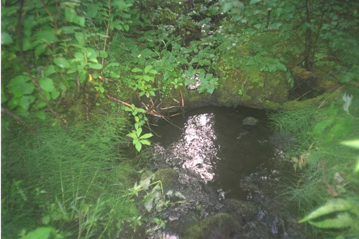
Direction of Photo: U CD #: 2 Image #: 34 Roll #: P3 Frame #: 1 Comment: View of site approximately 125 metres upstream from the confluence with tributary ILP 70063.

Site # 2 ILP # 70001 ILP Map # 093L.007 Reach # 22.0 Watershed Code: 000-000000-00000-00000-0000-0000-000-000-000-000-000-000