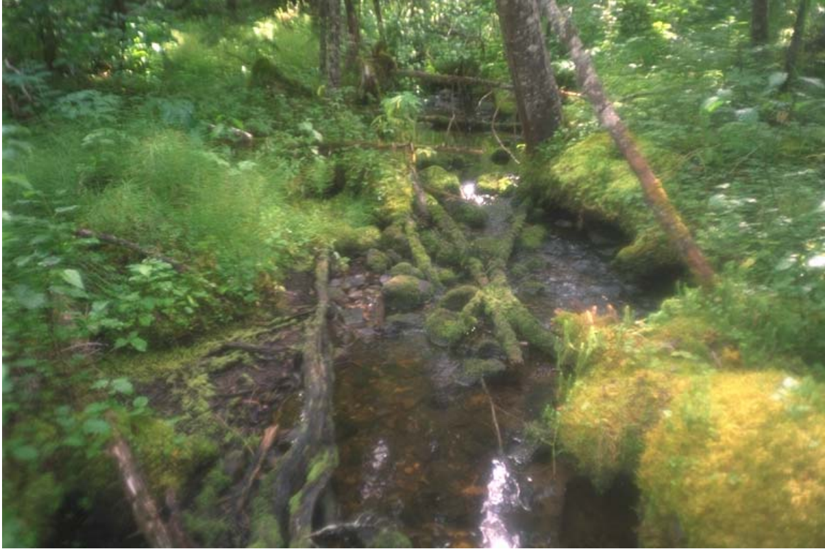
Direction of Photo: U CD #: 2 Image #: 41 Roll #: P3 Frame #: 8 Comment: View of site 345 metres upstream of the confluence with the mainstem ILP 70051.