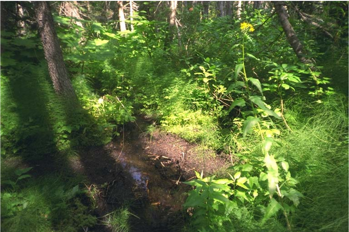
Direction of Photo: D CD #: 2 Image #: 6 Roll #: P1 Frame #: 6 Comment: View of fines, 24 metres upstream of Peter Aleck Creek.