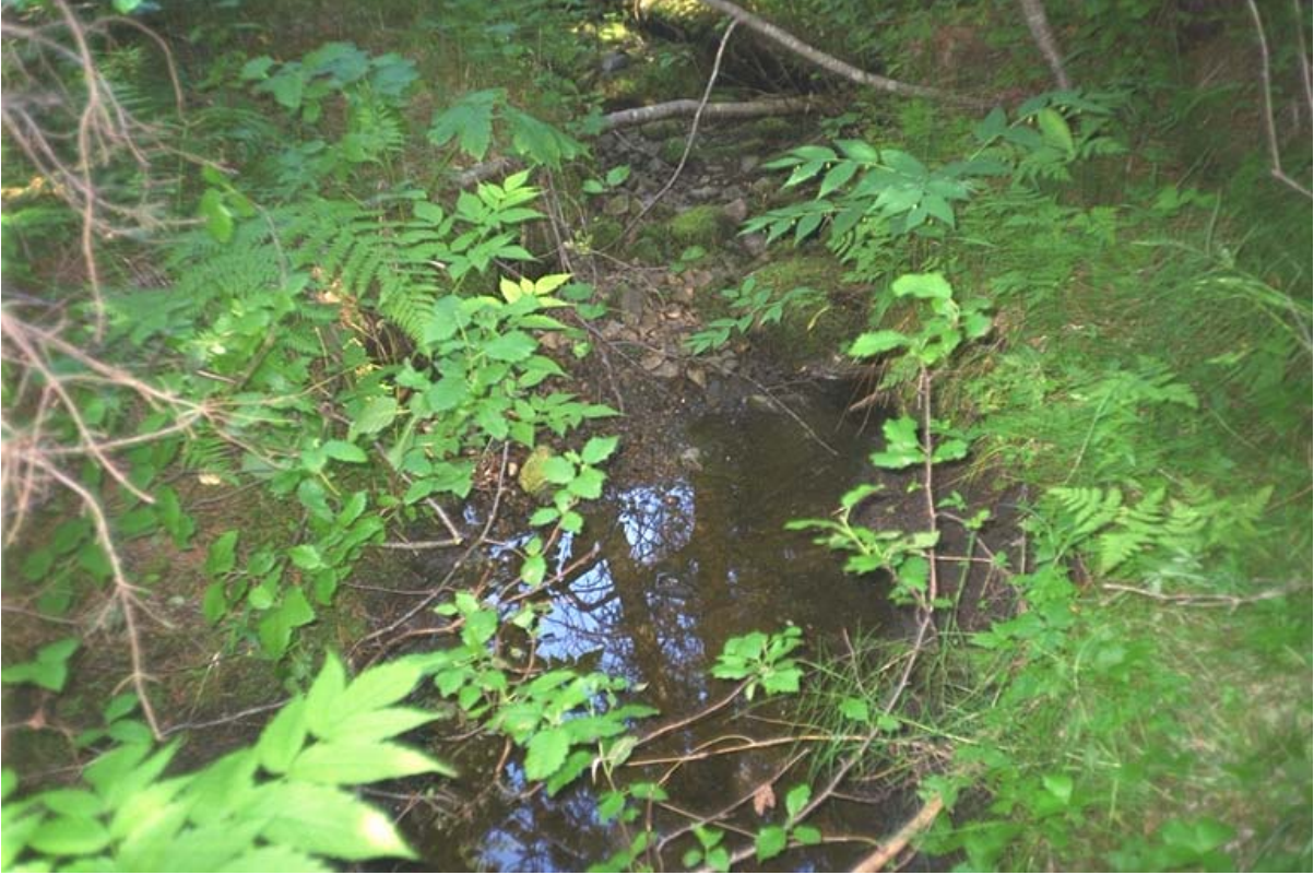
Direction of Photo: U CD #: 2 Image #: 14 Roll #: P1 Frame #: 14 Comment: View 110 metres upstream of the confluence with Peter Aleck Creek.

Site # 10 ILP # 70029 ILP Map # 093L.006 Reach # 1.0 Watershed Code: 000-000000-00000-00000-0000-0000-000-000-000-000-000-000