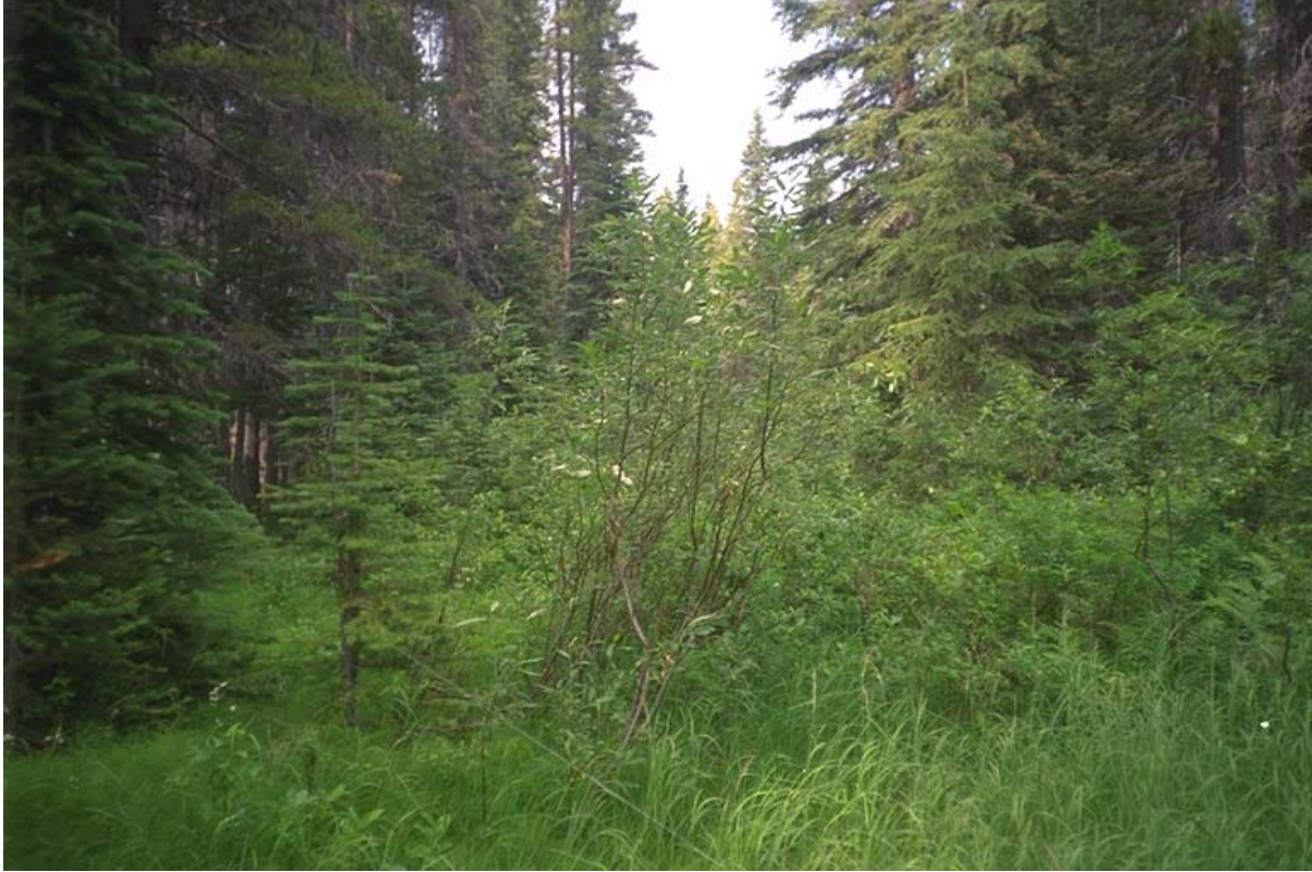
Direction of Photo: U CD #: 2 Image #: 7 Roll #: P1 Frame #: 7 Comment: View 90 metres upstream of Peter Aleck Creek.

Site # 14 ILP # 70040 ILP Map # 093L.006 Reach # 1.0 Watershed Code: 000-000000-00000-00000-0000-0000-000-000-000-000-000-000