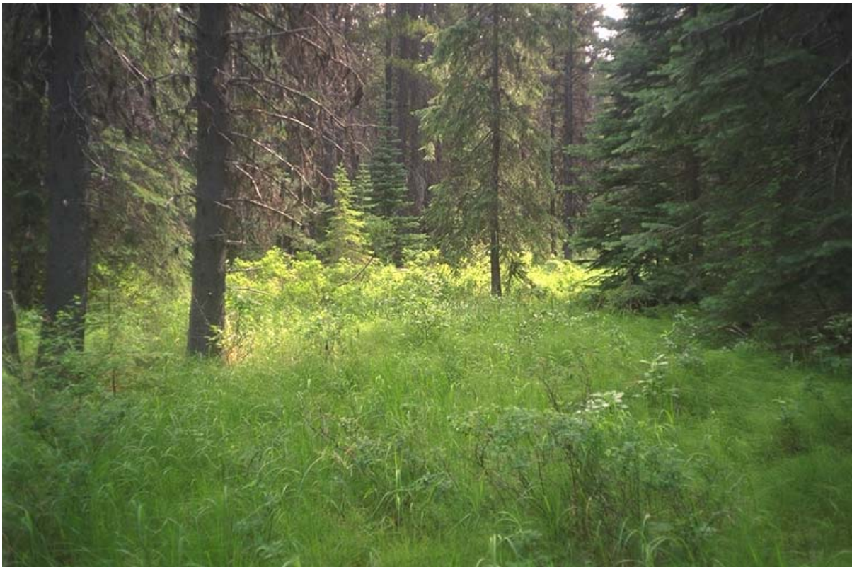
Direction of Photo: D CD #: 2 Image #: 8 Roll #: P1 Frame #: 8 Comment: View 90 metres upstream of Peter Aleck Creek.