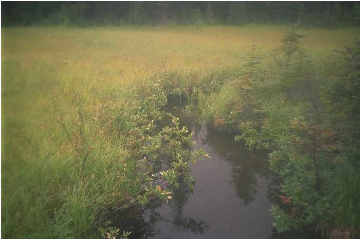
Direction of Photo: D CD #: 2 Image #: 52 Roll #: P3 Frame #: 19 Comment: View of site 100 metres upstream from reach 2 (edge of wetland).