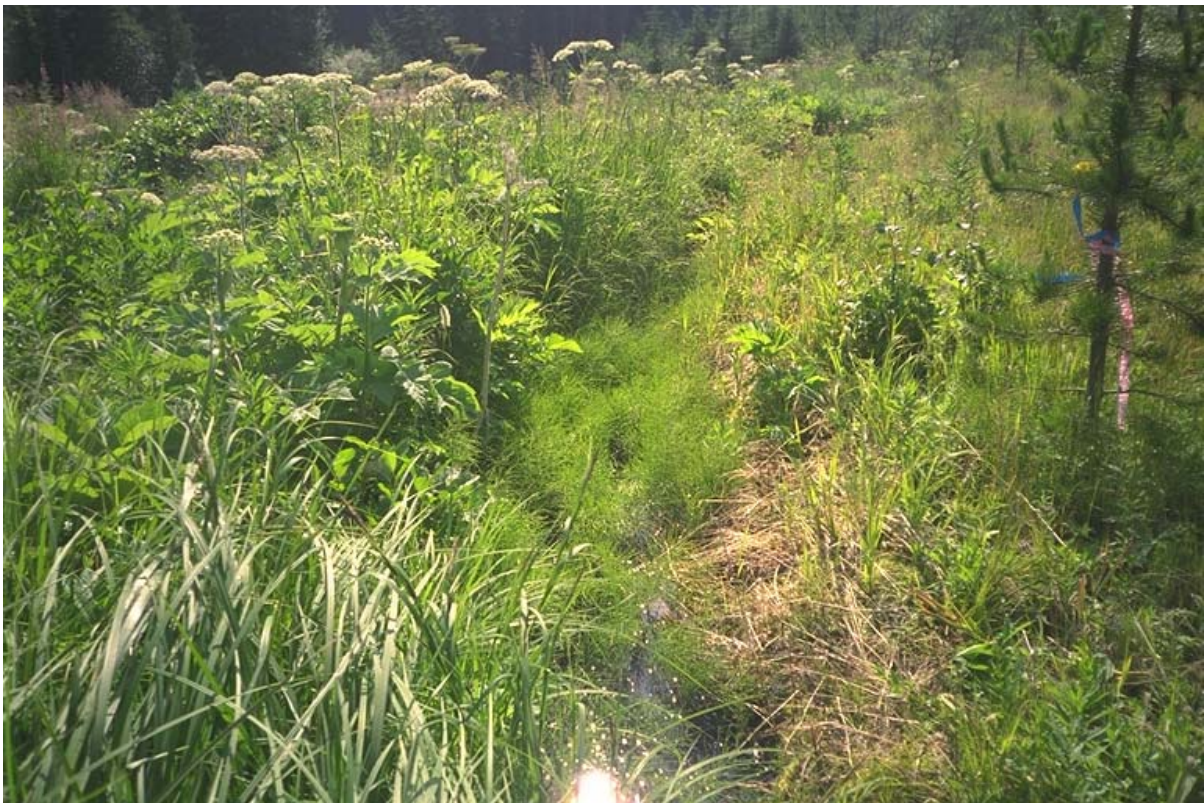
Direction of Photo: D CD #: 2 Image #: 2 Roll #: P1 Frame #: 2 Comment: View 55 metres upstream of Peter Aleck Creek.