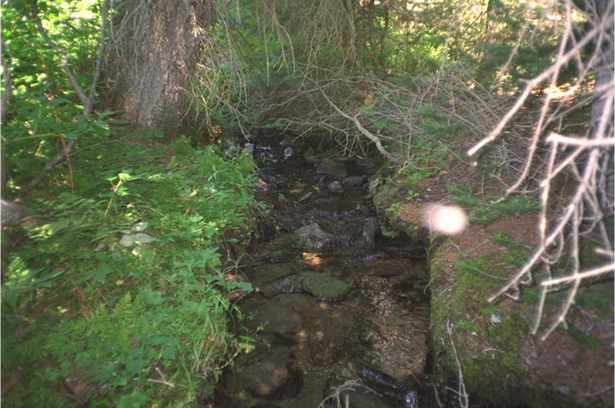
Direction of Photo: U CD #: 2 Image #: 18 Roll #: P1 Frame #: 18 Comment: View of site 225 metres upstream of the confluence with Peter Aleck Creek.

Site # 8 ILP # 70023 ILP Map # 093L.006 Reach # 2.0 Watershed Code: 000-000000-00000-00000-0000-000-000-000-000-000-000