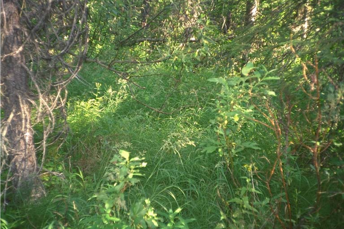
Direction of Photo: U CD #: 2 Image #: 31 Roll #: P2 Frame #: 3 Comment: View of site 100 metres upstream of wetland in reach 5.

Site # 4 ILP # 70013 ILP Map # 093L.006 Reach # 6.0 Watershed Code: 000-000000-00000-00000-0000-000-000-000-000-000-000-000