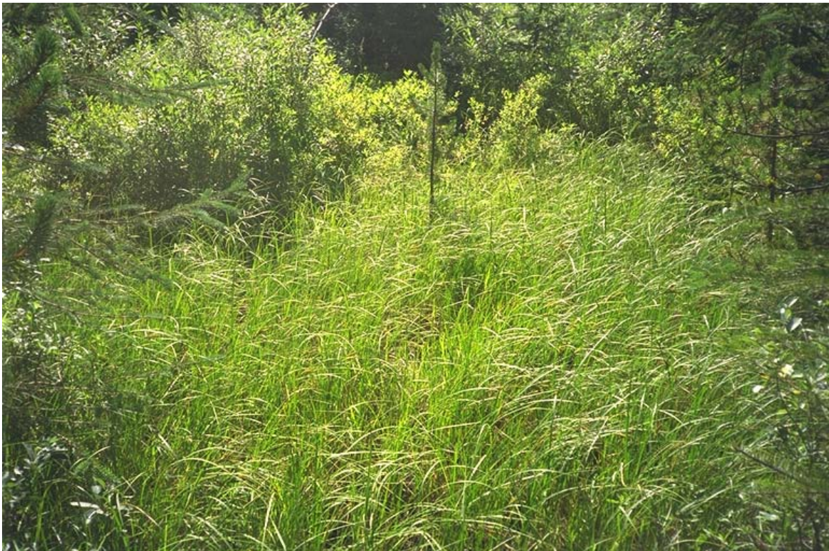
Direction of Photo: D CD #: 2 Image #: 17 Roll #: P1 Frame #: 17 Comment: View of site 100 metres upstream of the confluence with ILP 70034.