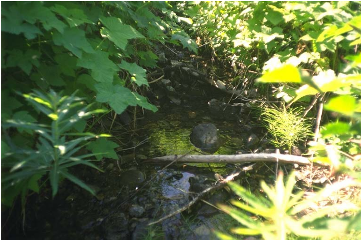
Direction of Photo: U CD #: 2 Image #: 23 Roll #: P1 Frame #: 23 Comment: View of site 100 metres above the road crossing (approximately 920 metres upstream from Peter Aleck Creek).