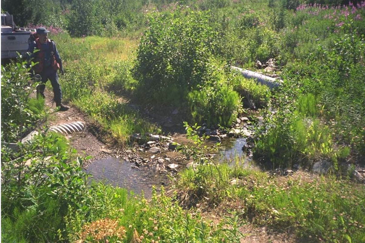
Direction of Photo: X CD #: 2 Image #: 22 Roll #: P1 Frame #: 22 Comment: View of the ford, showing ruined culvert.

Site # 9 ILP # 70026 ILP Map # 093L.006 Reach # 2.0 Watershed Code: 000-000000-00000-00000-0000-0000-000-000-000-000-000-000