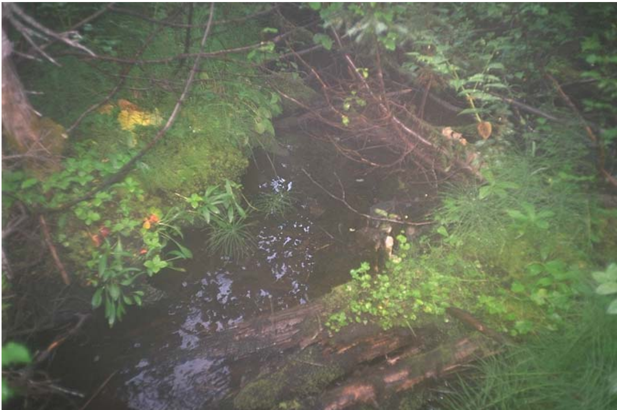
Direction of Photo: D CD #: 2 Image #: 35 Roll #: P3 Frame #: 2 Comment: View of site approximately 125 metres upstream from the confluence with tributary ILP 70063.