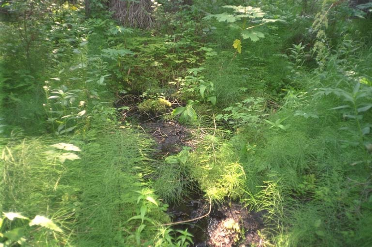
Direction of Photo: U CD #: 2 Image #: 5 Roll #: P1 Frame #: 5 Comment: View of seepage area, 26 metres upstream of the confluence with ILP 70043.

Site # 17 ILP # 70045 ILP Map # 093L.006 Reach # 1.0 Watershed Code: 000-000000-00000-00000-0000-000-000-000-000-000-000-000