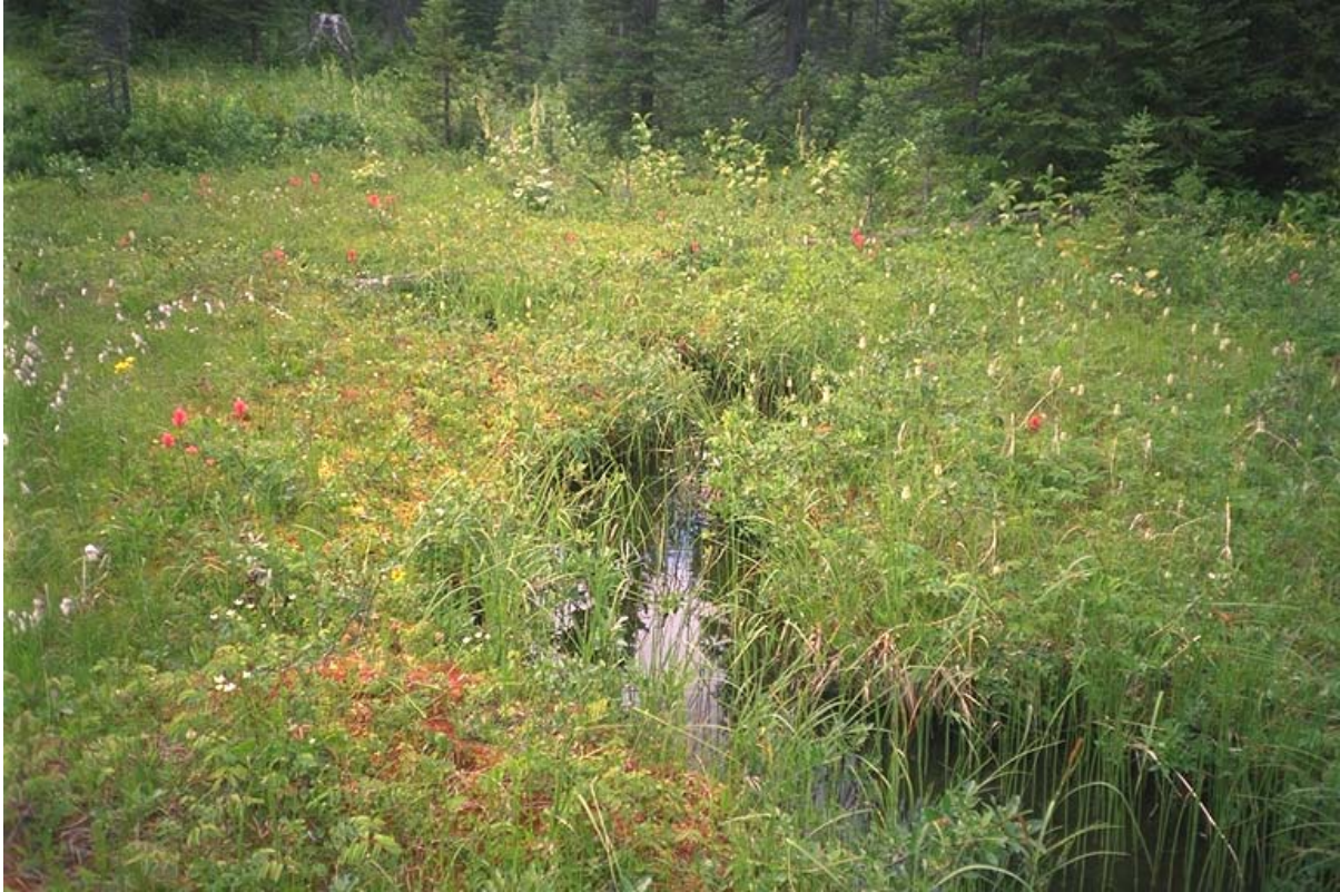
Direction of Photo: U CD #: 2 Image #: 64 Roll #: P4 Frame #: 9 Comment: At the top end of reach approximately 1900 metres upstream of Peter Aleck Creek.

Site # 18 ILP # 70046 ILP Map # 093L.006 Reach # 2.0 Watershed Code: 000-000000-00000-00000-0000-000-000-000-000-000-000