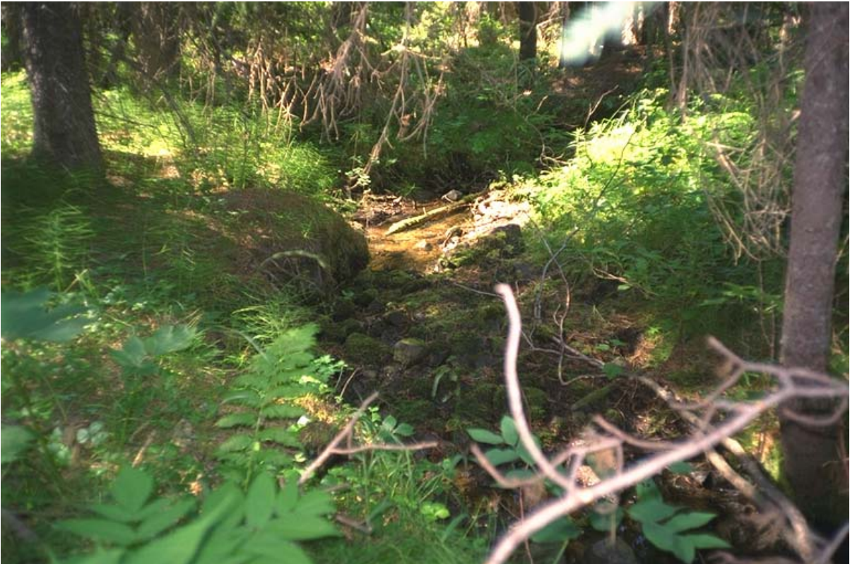
Direction of Photo: D CD #: 2 Image #: 15 Roll #: P1 Frame #: 15 Comment: View 110 metres upstream of the confluence with Peter Aleck Creek.