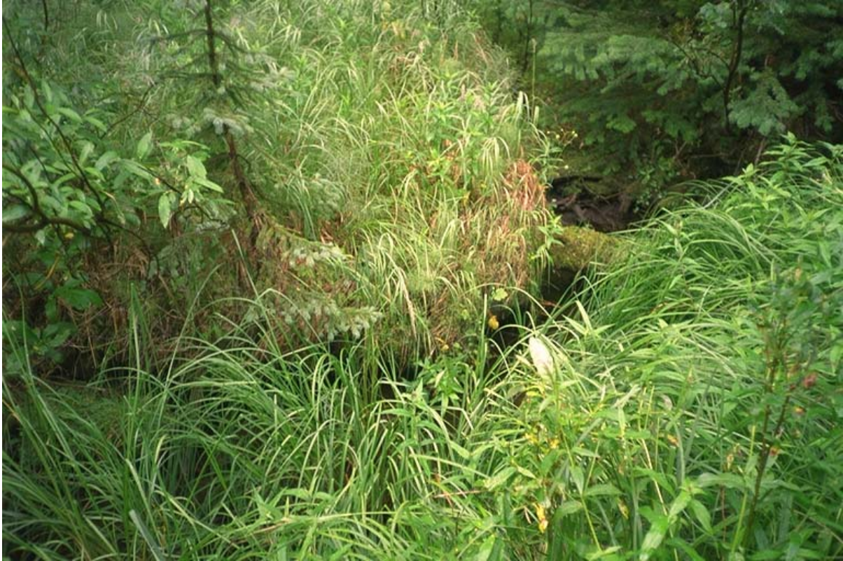
Direction of Photo: U CD #: 2 Image #: 56 Roll #: P4 Frame #: 1 Comment: Approximately 50 metres downstream of the confluence with tributary ILP 70060.

Site # 1 ILP # 70001 ILP Map # 093L.007 Reach # 18.0 Watershed Code: 000-000000-00000-00000-0000-0000-000-000-000-000-000-000