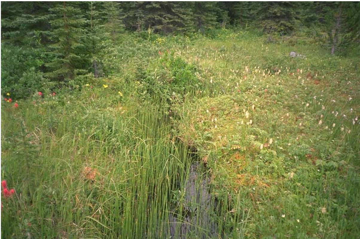
Direction of Photo: D CD #: 2 Image #: 65 Roll #: P4 Frame #: 10 Comment: At the top end of reach approximately 1900 metres upstream of Peter Aleck Creek.