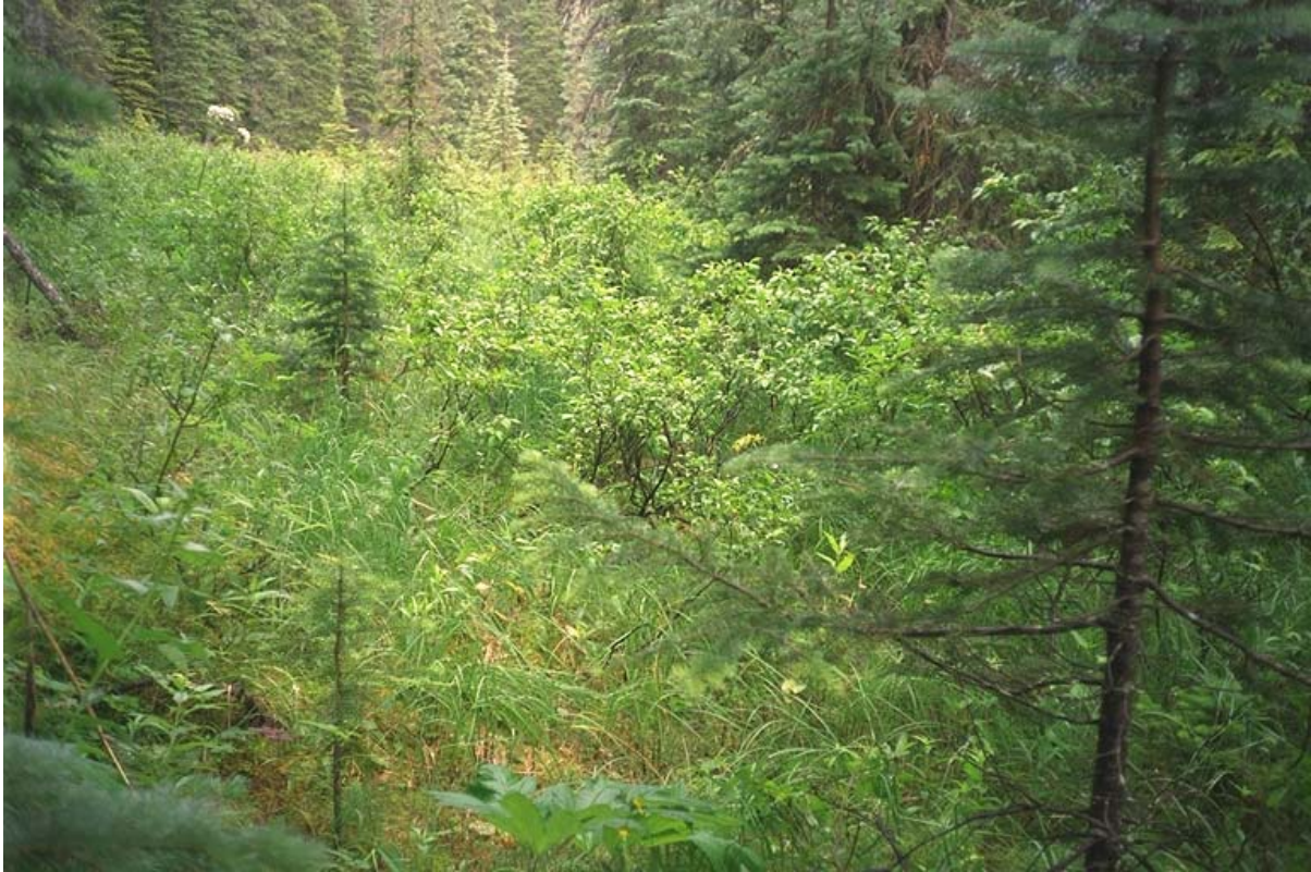
Direction of Photo: U CD #: 2 Image #: 58 Roll #: P4 Frame #: 3 Comment: Approximately 30 metres upstream of Peter Aleck Creek.

Site # 24 ILP # 70060 ILP Map # 093L.006 Reach # 1.0 Watershed Code: 000-000000-00000-00000-0000-000-000-000-000-000-000