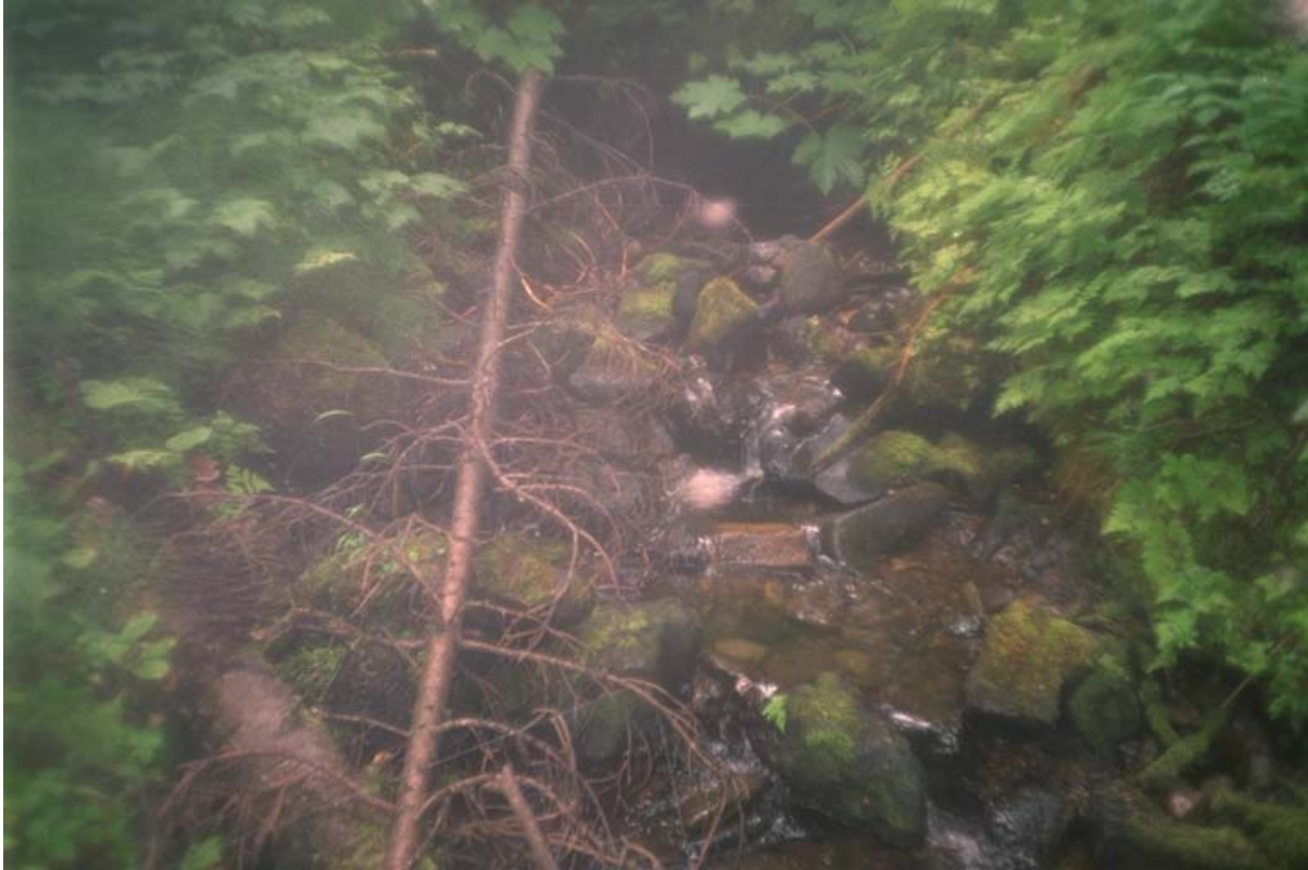
Direction of Photo: U CD #: 2 Image #: 38 Roll #: P3 Frame #: 5 Comment: View of site approximately 40 metres upstream of the mapped confluence with Peter Aleck Creek.

Site # 26 ILP # 70060 ILP Map # 093L.006 Reach # 2.0 Watershed Code: 000-000000-00000-00000-0000-0000-000-000-000-000-000-000