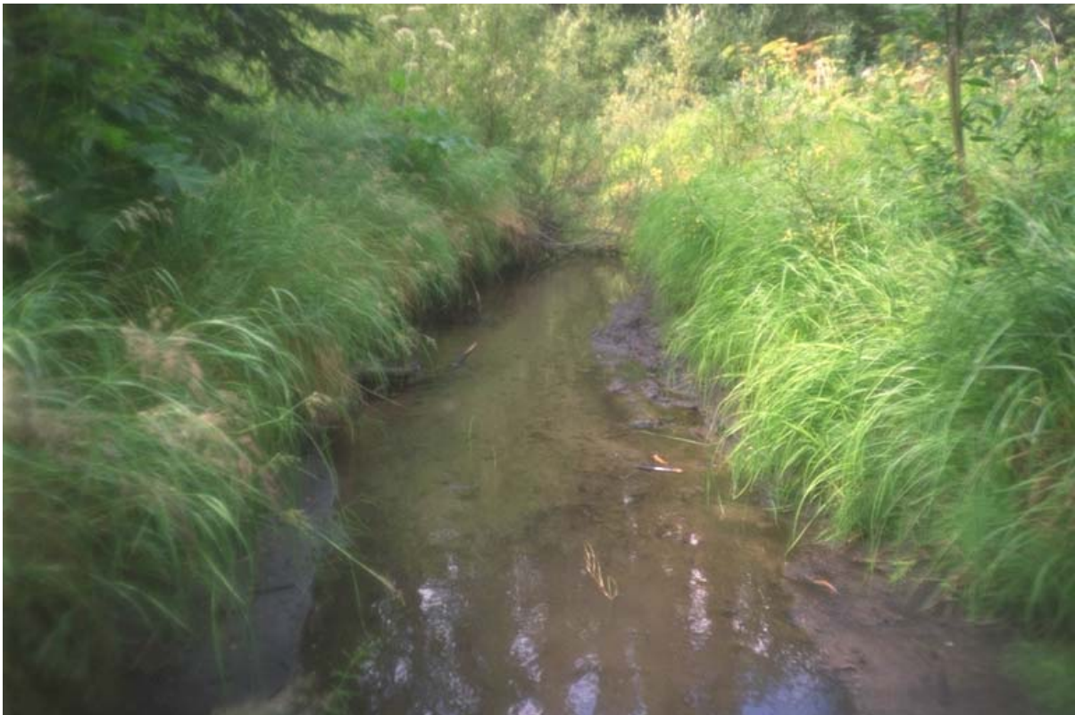
Direction of Photo: D CD #: 2 Image #: 46 Roll #: P3 Frame #: 13 Comment: View of site 125 metres upstream of confluence with Peter Aleck Creek.