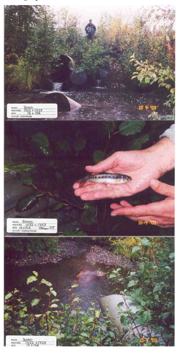
Photo 1. 3000 Road-Site 13/1722 culvert outlet conditions. 35cm outfall drop on both culverts.