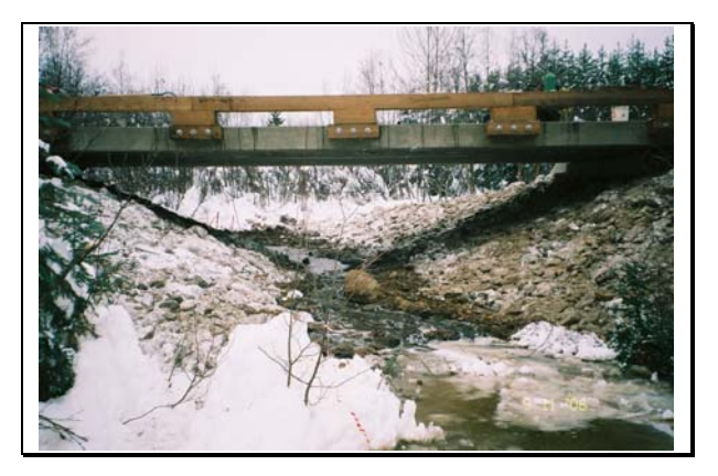
Photo 2. 3000 Road-Site 13/1722, u/s view of reconstructed stream channel (Nov.9/06).