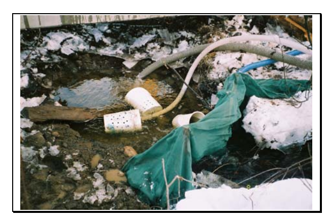
Photo 3. 3000 Road-Site 13/1722, Sumphole at u/s end of in-stream work site.