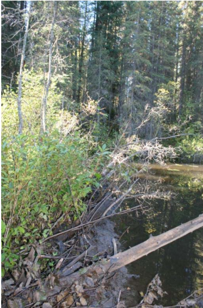
Photo 7 One of several beaver dams blocking Olympic Lake outlet to Olympic Creek