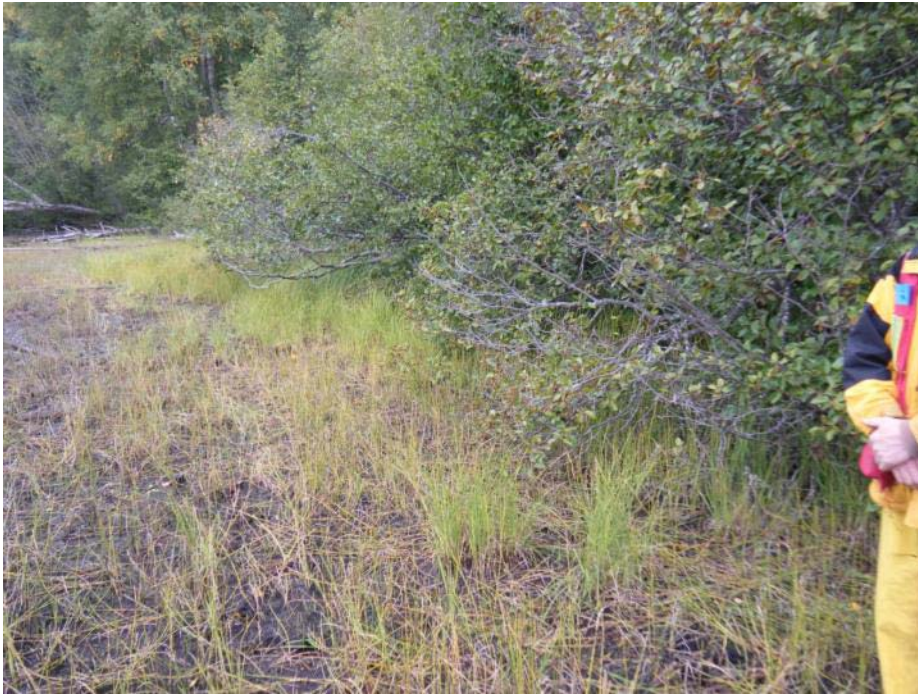
Photo 11 Morrison Lake shoreline and vegetation at the proposed off-lake channel site