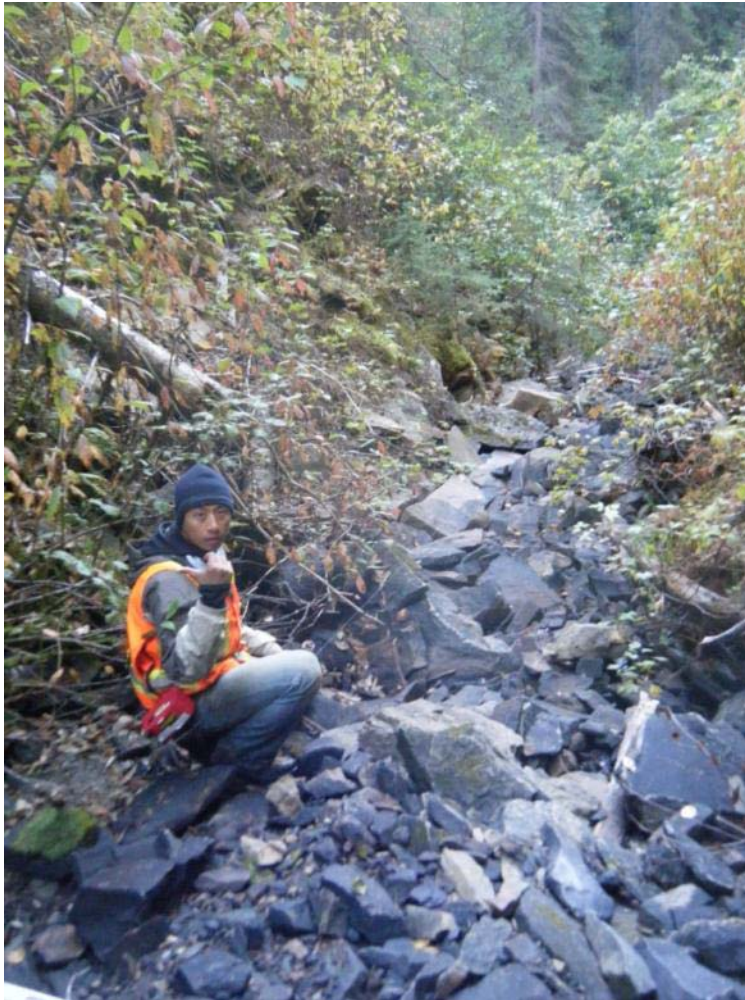
Photo 4 Angular cobble and boulders in Olympic Creek