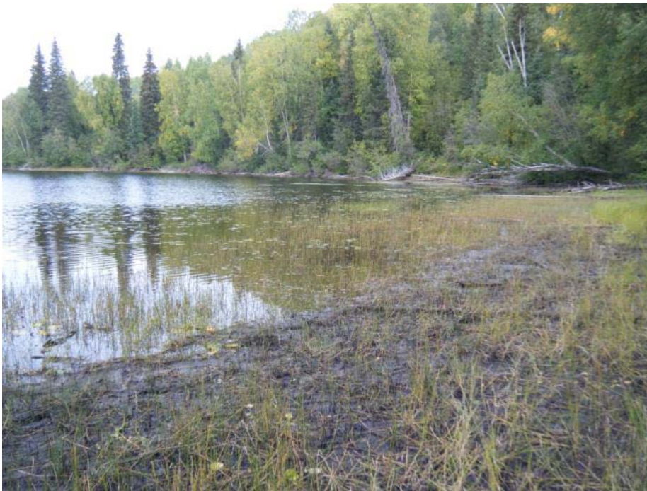
Photo 10 Morrison Lake Shoreline at the proposed off-lake channel site