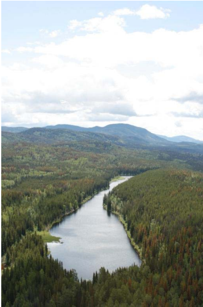
Photo 1 Olympic Lake