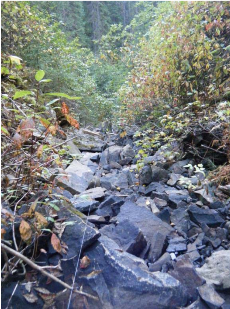
Photo 10 Angular boulders within the Olympic Creek