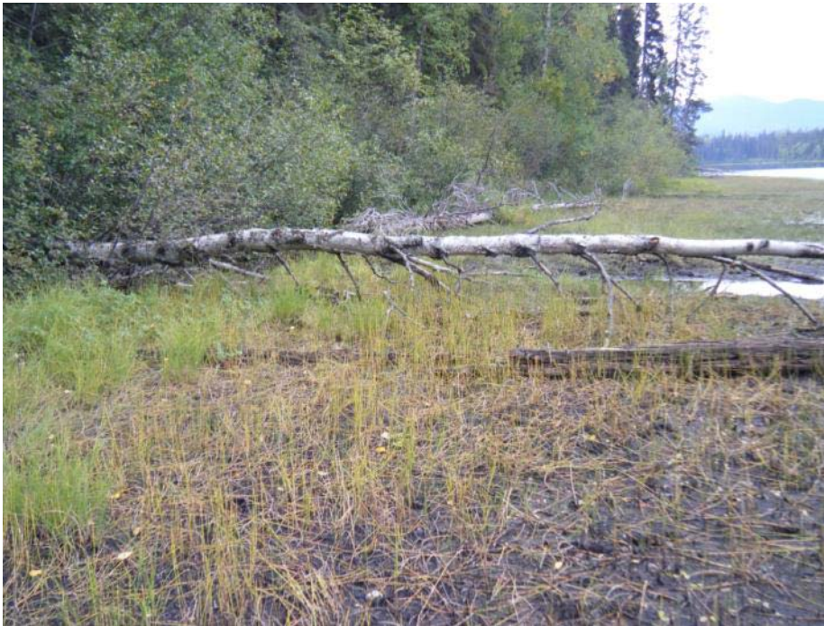
Photo 3 Shoreline with emergent vegetation and LWD at the proposed off-lake channel location