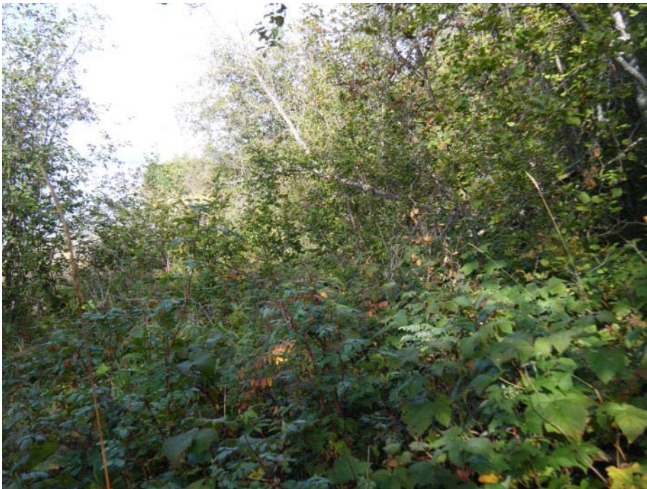
Photo 6 Riparian vegetation at the proposed off-lake channel location