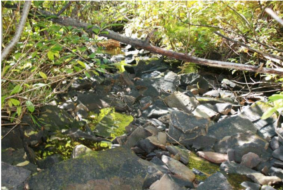
Photo 8 Typical Olympic Creek boulders and riparian vegetation