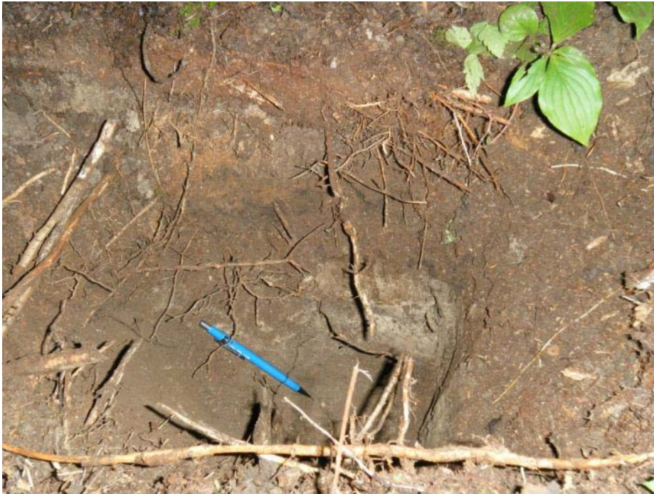
Photo 7 Soil profile within the off-lake channel area