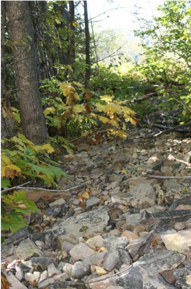
Photo 9 Olympic Creek main channel near Morrison Lake