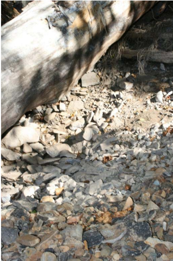
Photo 5 LWD and substrates in lower Olympic Creek