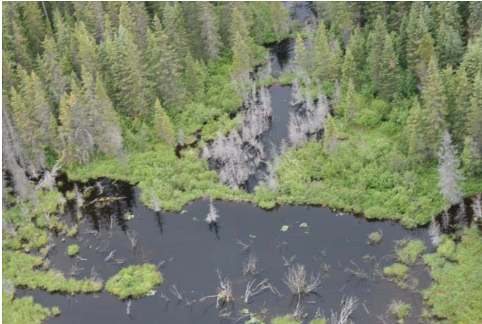
Photo 2 Beaver Dams and flooded forest at the Olympic Lake outlet