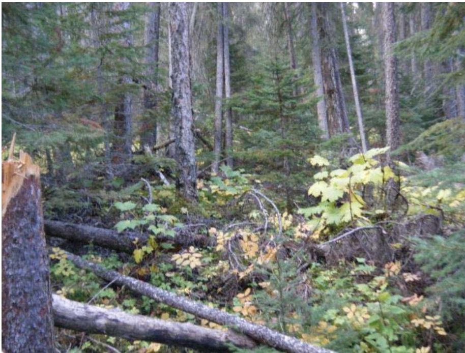
Photo 4 Vegetation and topography in the proposed off-lake channel location