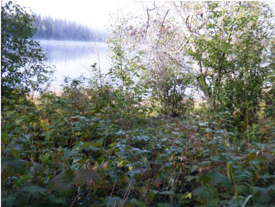
Photo 5 Riparian and shoreline vegetation at the proposed off-lake channel location