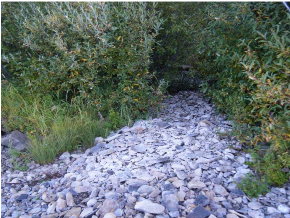
Photo 3 Olympic Creek Outlet into Morrison Lake