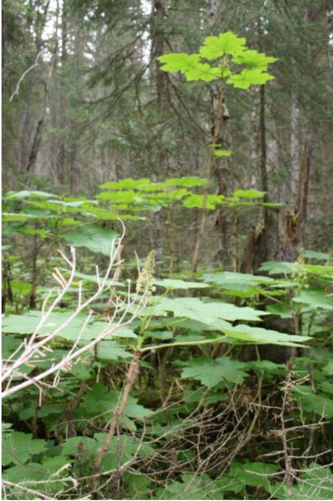
Photo 2 Typical vegetation within the proposed off-lake channel area