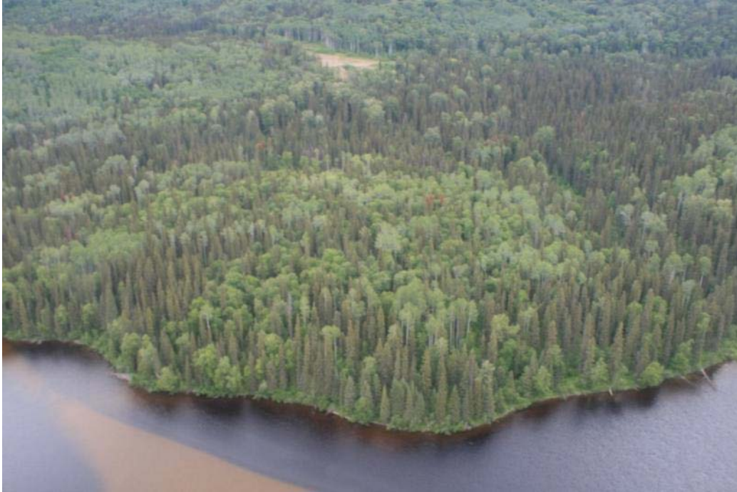
Photo 1 Proposed off-lake channel location on the southeast shoreline of Morrison Lake