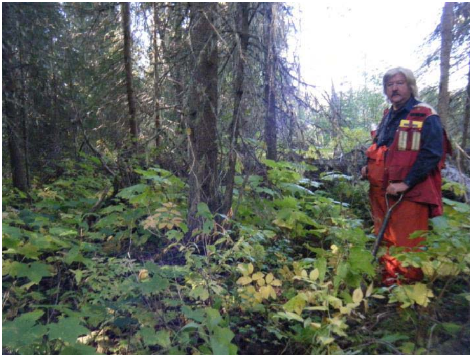
Photo 8 Proposed off-lake channel vegetation and topography