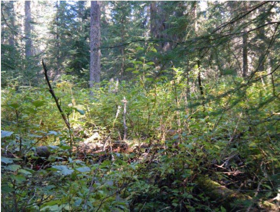
Photo 9 Vegetation at the proposed off-lake channel site